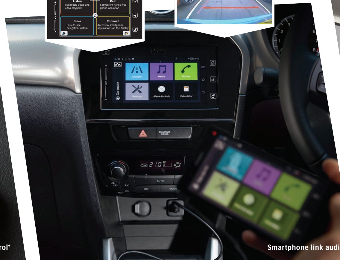
Smartphone link audio*