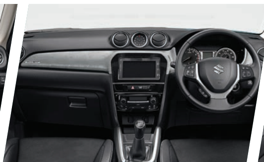
Chequered instrument panel