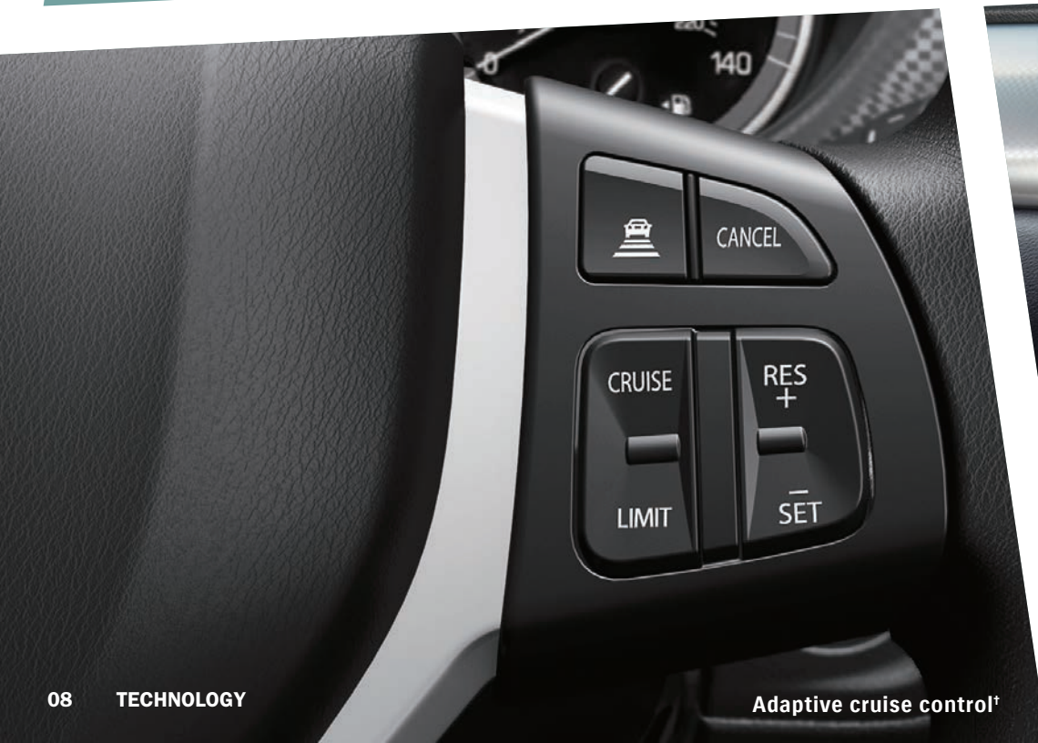
Adaptive cruise control†