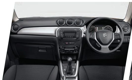
Silver instrument panel