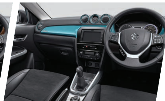
Turquoise instrument panel and vent surrounds

As standard on Atlantis Turquoise/Cosmic Black exterior colour option.