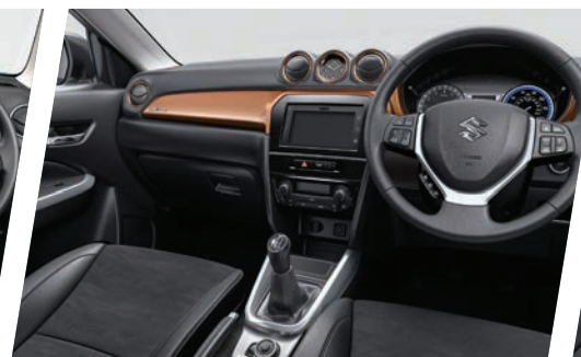
Orange instrument panel and vent surrounds

As standard on Horizon Orange/Cosmic Black exterior colour option.