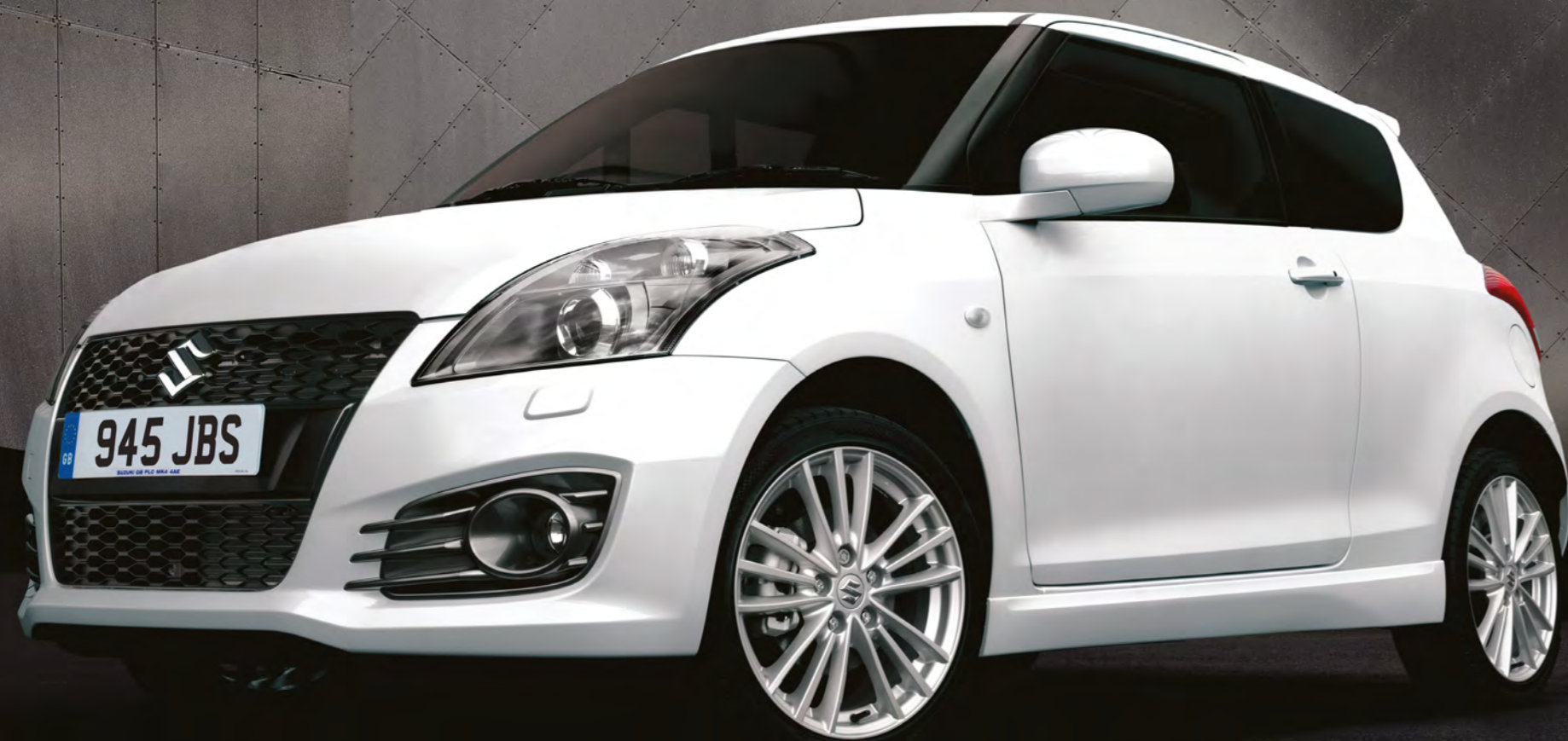
◆ High Intensity Discharge headlamps