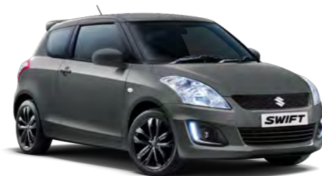
Galactic Grey Metallic Available on all models