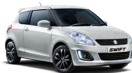
Silky Silver Metallic Available on Swift SZ2, Swift SZ3 4x4, Swift SZ4, Swift SZ4 4x4 and Swift SZ-L