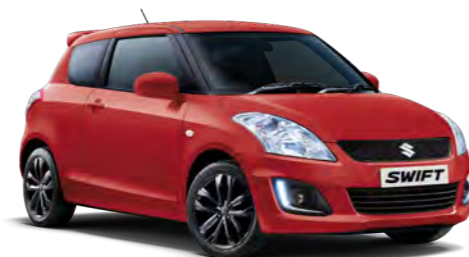
Bright Red Available on Swift SZ2, Swift SZ3 4x4, Swift SZ4, Swift SZ4 4x4 and Swift SZ-L