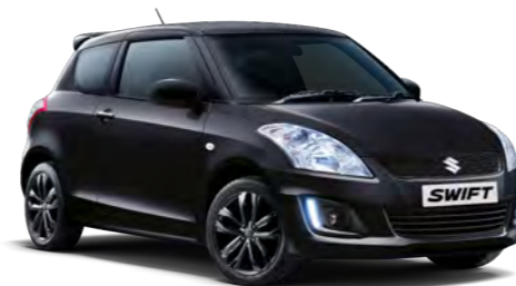
Cosmic Black Pearl Metallic Available on all models