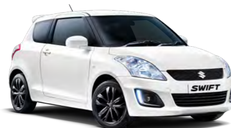
Superior White Available on Swift SZ2, Swift SZ3 4x4, Swift SZ4 and Swift SZ4 4x4 (image for illustration only)