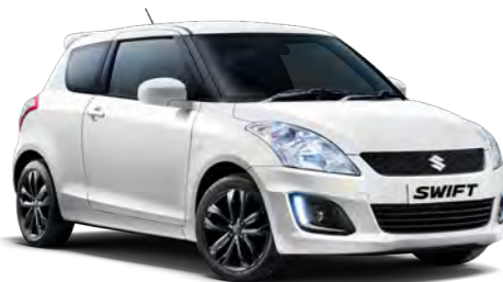
Cool White Pearl Metallic Available on all models