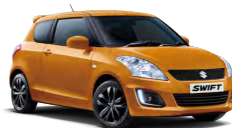
Horizon Orange Only available on Swift SZ-L