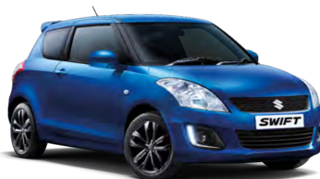
Boost Blue Pearl Metallic Available on all models