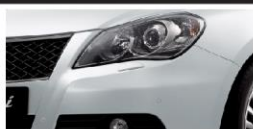
Snow White Pearl