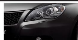
Super Black Pearl