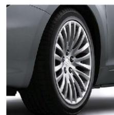
17-inch Alloy Wheels