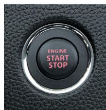
Keyless Push Start