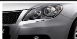
Star Silver Pearl