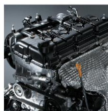
2.4 Liter, 4 Cylinder VVT Engine

Riding on a track-tuned, highly rigid sports chassis and powered by a feisty 2.4 liter engine, Kizashi is set to match or surpass everything in its class. With a choice of 6-speed manual or CVT automatic transmission, this is a car that will instantly appeal to the driver in you.