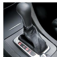
CVT with 6-Speed Manual Mode Transmission