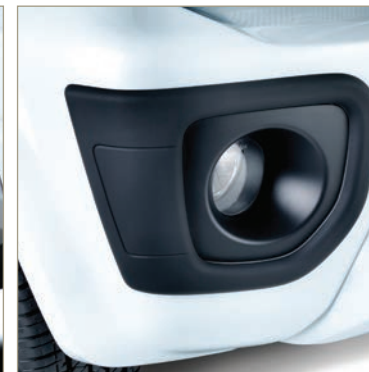
BUMPER CORNER PROTECTOR SET