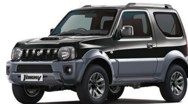
BLUEISH BLACK PEARL METALLIC/ QUASAR GREY 2-TONE†