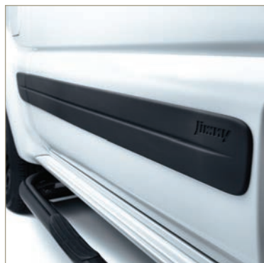
SIDE MOULDING SET