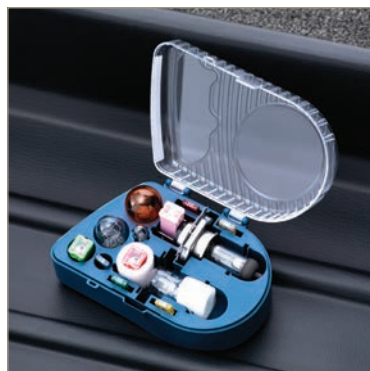
SPARE BULB AND FUSE SET