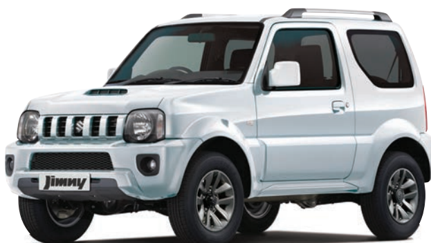
PEARL WHITE METALLIC†