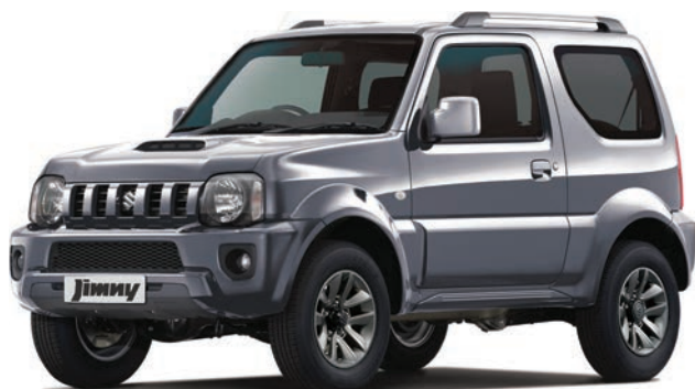
QUASAR GREY METALLIC*†