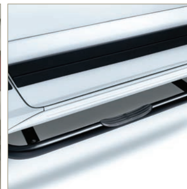
SIDE SPORT BAR SET (BLACK)