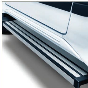
ALUMINIUM RUNNING BOARD