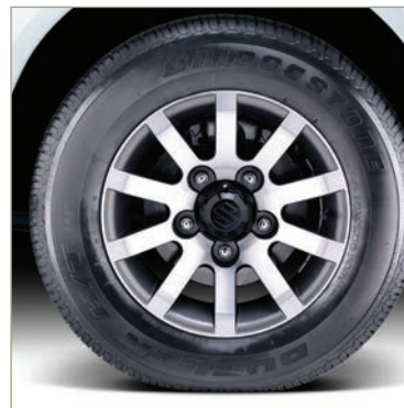
'DAKAR' ALLOY WHEEL