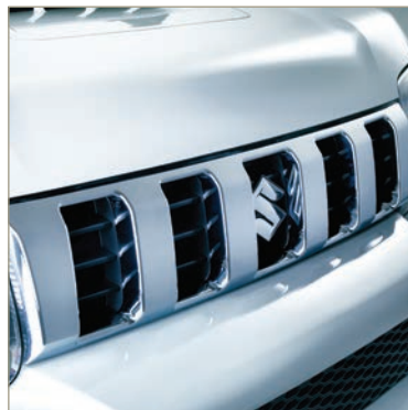
CHROMED FRONT GRILLE TRIM