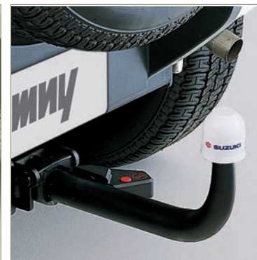
DETACHABLE TOW-BAR ASSEMBLY