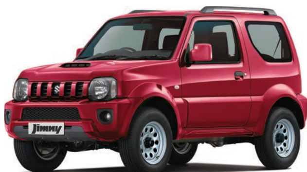
PHOENIX RED PEARL METALLIC*