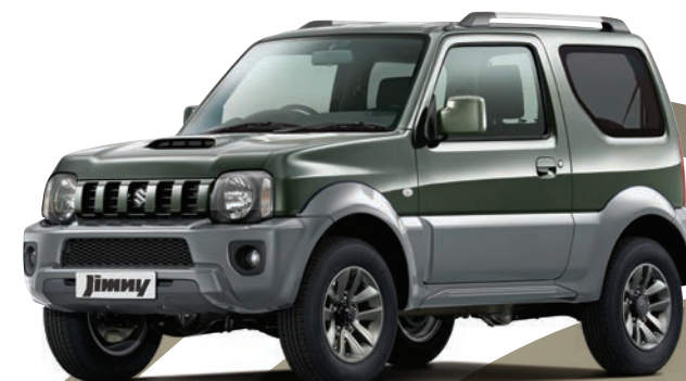
KHAKI GREEN METALLIC/ QUASAR GREY 2-TONE†