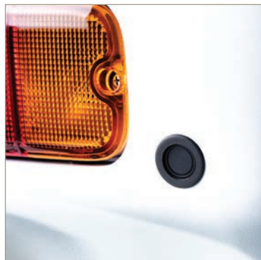
REVERSING AID SENSOR SET