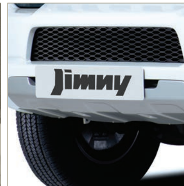
FRONT SKID PLATE