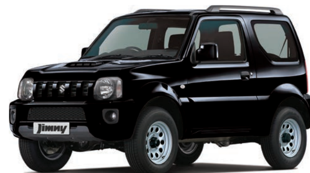
BLUEISH BLACK PEARL METALLIC*