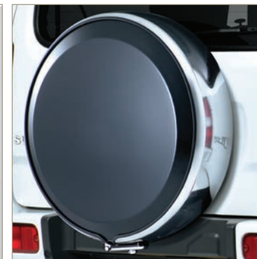
HARD SPARE WHEEL COVER