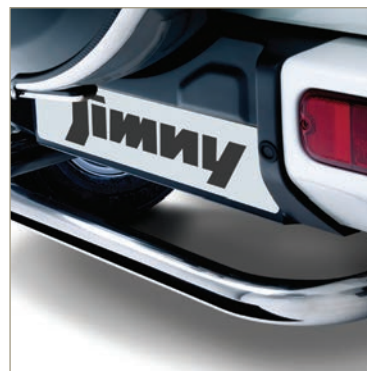
CHROMED REAR SPORT BAR