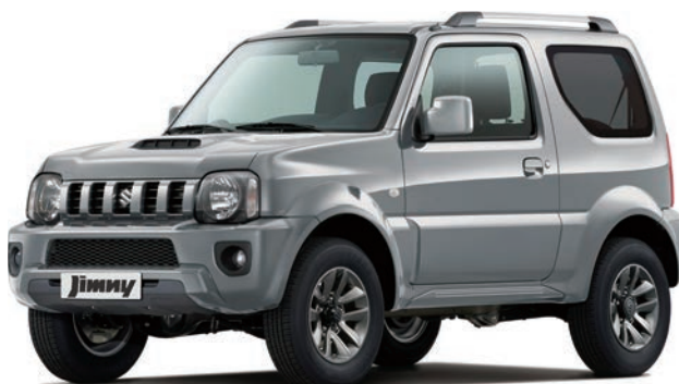
STEEL SILVER METALLIC†