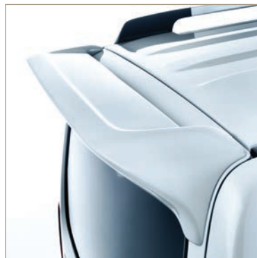
REAR UPPER SPOILER