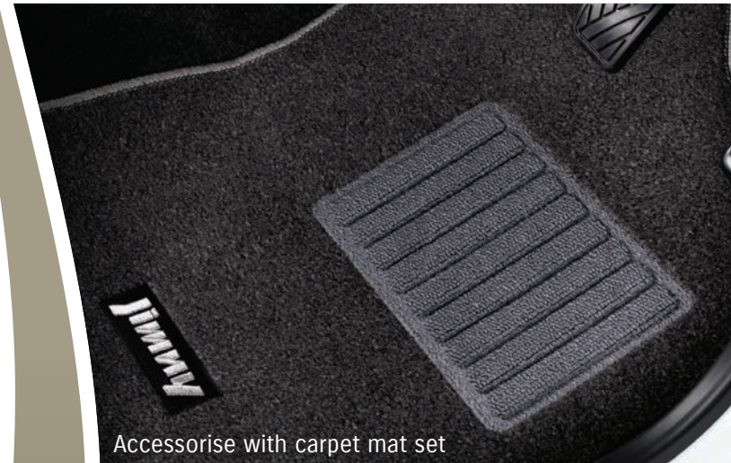
Accessorise with carpet mat set