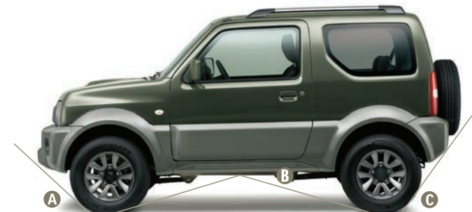
A 34° approach angle B 31° ramp breakover angle C 46° departure angle (default setting, unloaded Jimny)

All year round, the Jimny is a 4x4 designed for adventure. Every time you climb aboard, there's one waiting to happen.