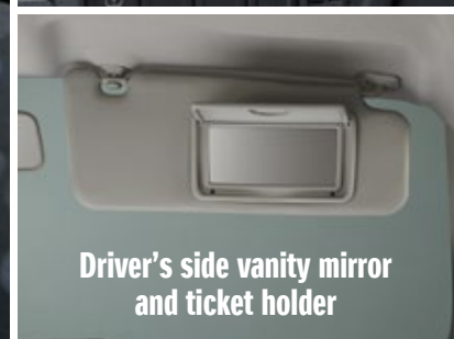
Driver's side vanity mirror and ticket holder