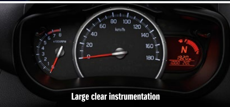
Large clear instrumentation

When it comes to interior space and comfort, Celerio is literally head and shoulders above the rest. With ample room for legs and big ideas, you can stretch out and relax in a stress-free riding environment. And thanks to the intelligent design, getting in and out is just as comfortable. While the easy to read meters are sleek and stylish, there's more that meets the eye behind the wheel of Celerio. The high seating position and expanded visibility increase the sense of freedom, while the interior design exudes superior comfort and quality to make driving through town an exercise in easy living and looking good.