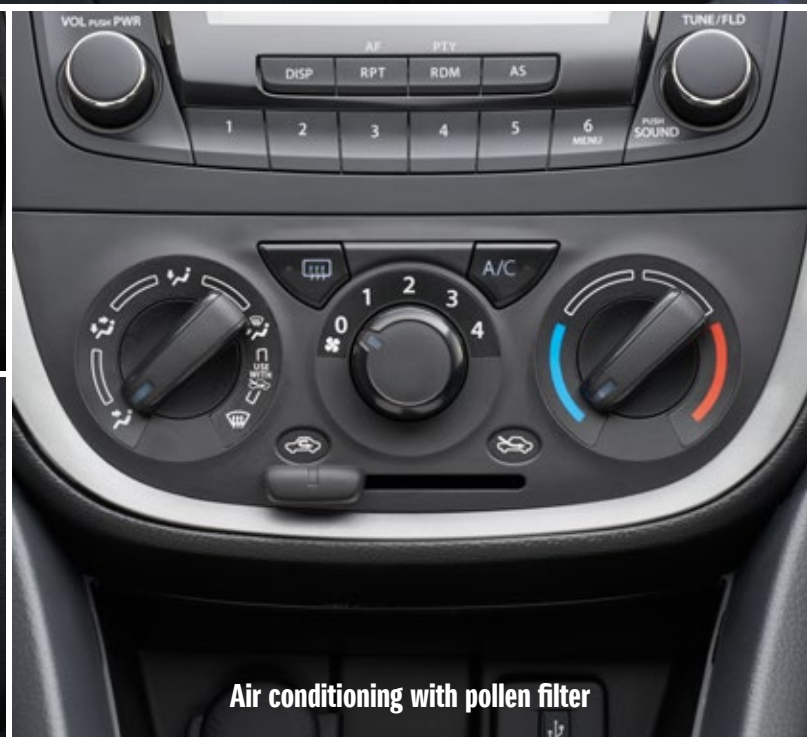
Air conditioning with pollen filter