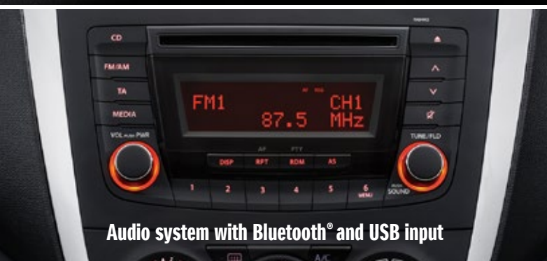
Audio system with Bluetooth® and USB input