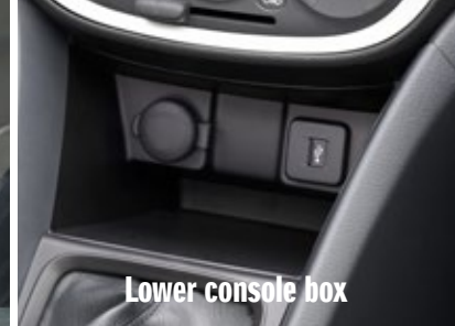
Lower console box