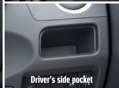
Driver's side pocket