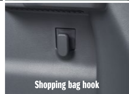
Shopping bag hook