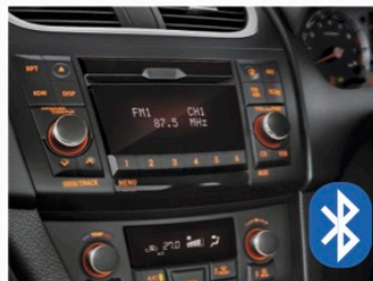
AUDIO SYSTEM WITH BLUETOOTH