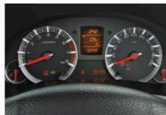
INSTRUMENT PANEL WITH MULTI-INFORMATION DISPLAY