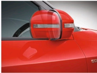
ELECTRIC RETRACTABLE MIRROR WITH TURN INDICATORS