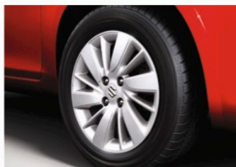
185/65 R15 ALLOY WHEELS