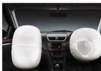
SUPERIOR DUAL SRS AIR BAGS