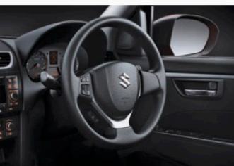
TILT STEERING & DRIVER SEAT HEIGHT ADJUSTMENT