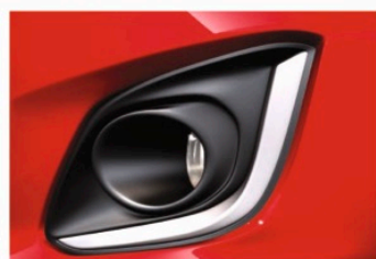
NEW FOG LAMP BEZEL (SILVER ACCENT)