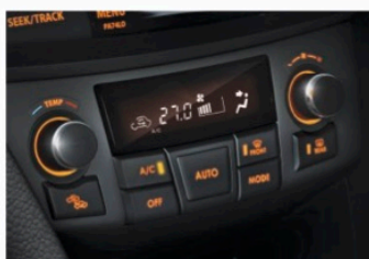
AUTOMATIC CLIMATE CONTROL