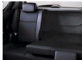
60:40 SPLIT SEATS