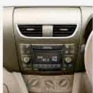
In-built music system