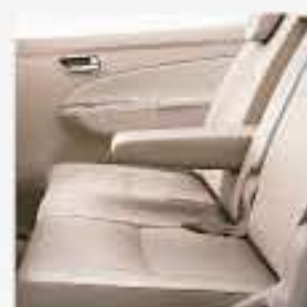
2 nd row armrest for comfort