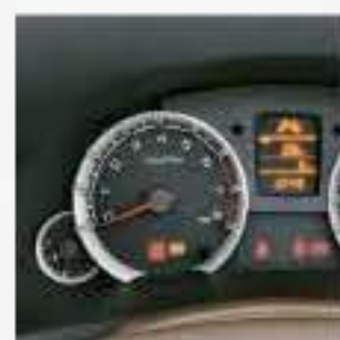
Stylish meter cluster with LCD display