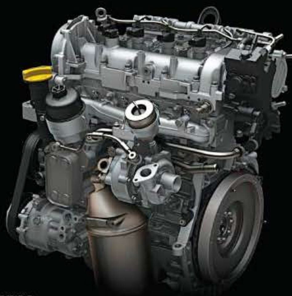
D13A DDiS Super turbo diesel engine: Superb performance