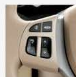
Stylish steering with integrated audio control