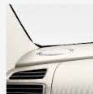
Tweeter for an enhanced audio experience