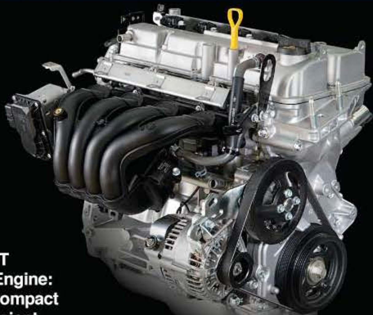
K14 VVT Petrol Engine: Light, compact and efficient

Once you are on the go in the Ertiga, the responsiveness of the engine will ensure that you never want the journey to end.