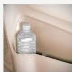
Front and rear door pocket