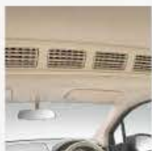
2 nd row AC with controls

The Ertiga is full of thoughtful little features that will make every journey more relaxed and comfortable.