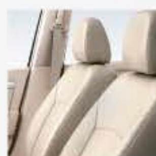
Textured premium upholstery