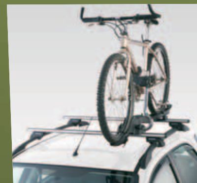
LOCKABLE BIKE CARRIER MODULE