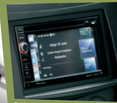
PIONEER MULTIMEDIA UNIT