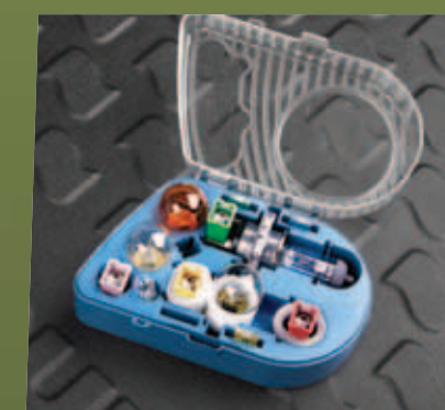
SPARE BULB AND FUSE KIT