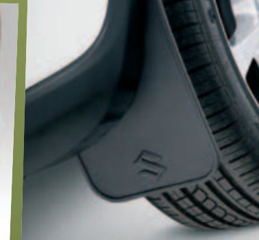
FLEXIBLE MUDFLAP SET