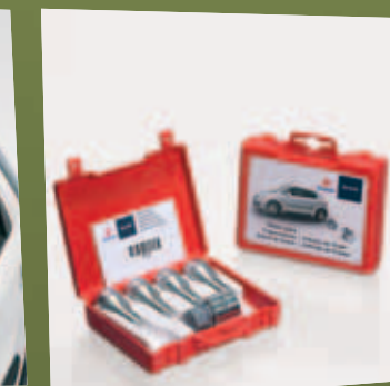
LOCKING WHEEL NUT SET