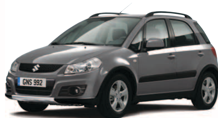
GALACTIC GREY METALLIC