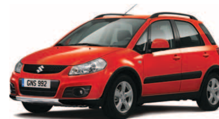
SUNLIGHT COPPER PEARL METALLIC