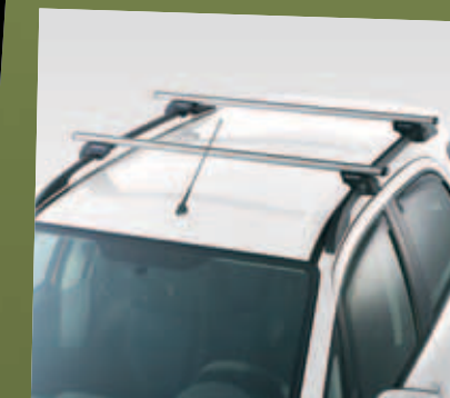
MULTI ROOF RACK