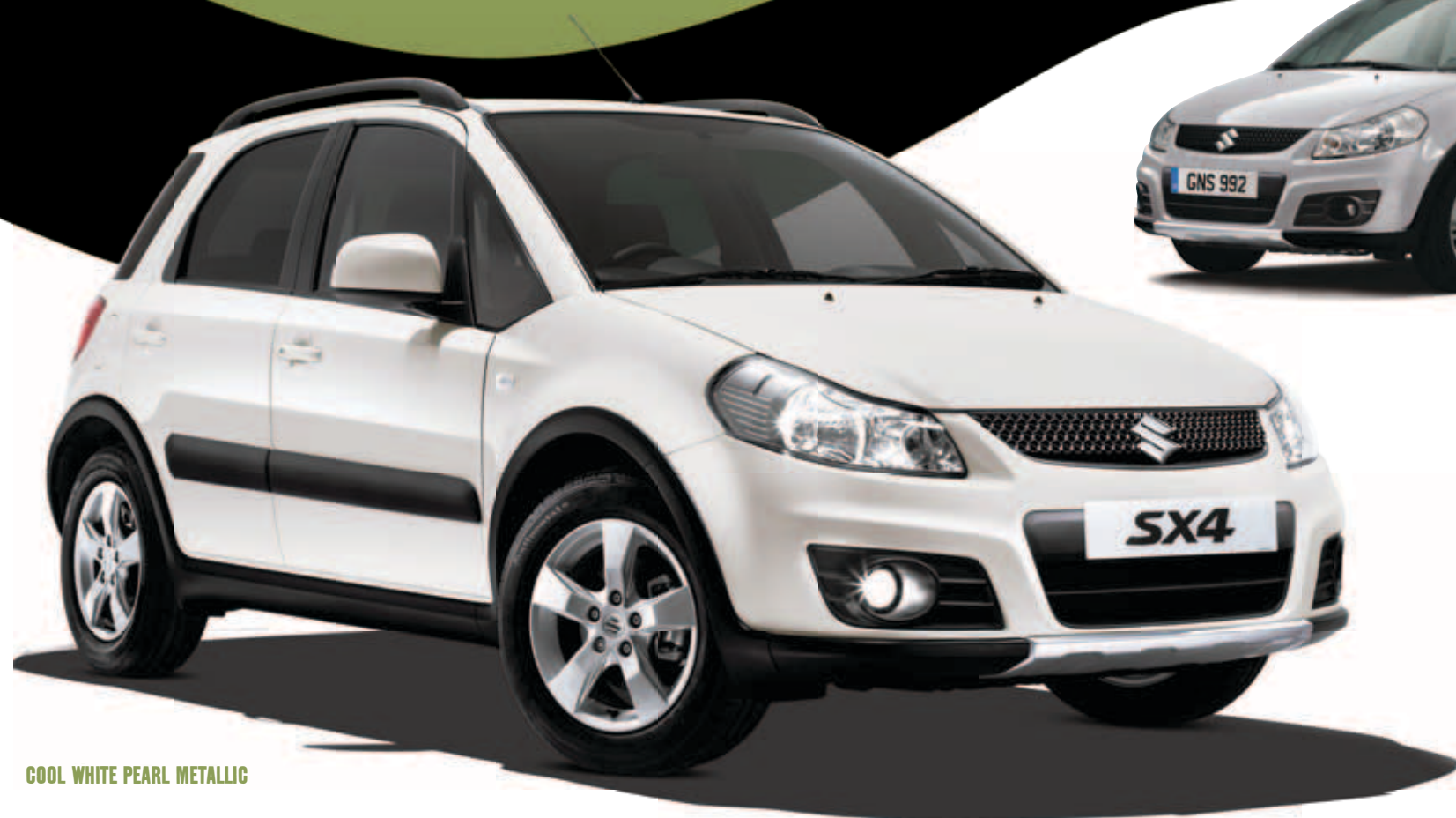
COOL WHITE PEARL METALLIC