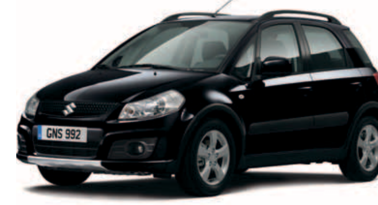
COSMIC BLACK PEARL METALLIC