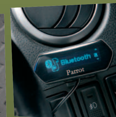
PARROT BLUETOOTH HANDS-FREE PHONE KIT