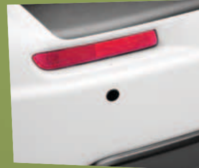
REAR PARKING SENSOR SET

There's no other car quite like the SX4. And no two SX4s need look the same either, thanks to our super-smart accessories which you can mix and match. You can find them all at www.suzuki.co.uk/cars/accessories