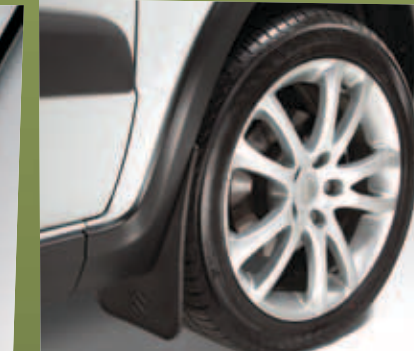
'VENICE' ALLOY WHEEL