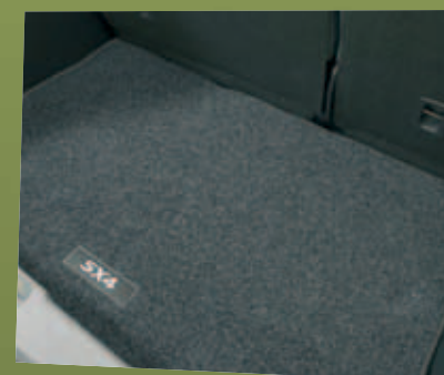
LUGGAGE AREA CARPET MAT