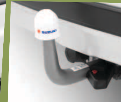
DETACHABLE TOW-BAR ASSEMBLY