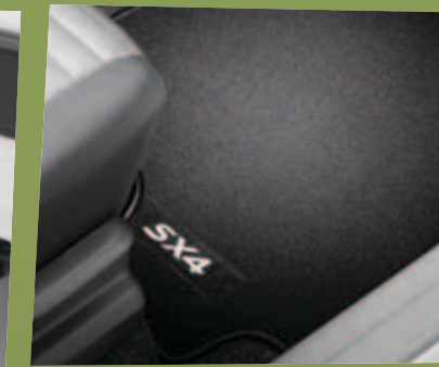
CARPET MAT SET