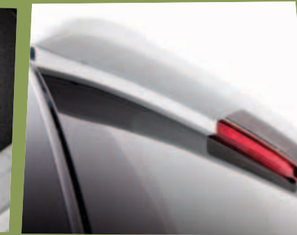
REAR UPPER SPOILER