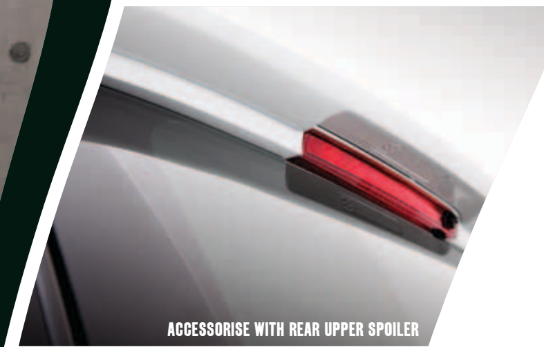
ACCESSORISE WITH REAR UPPER SPOILER