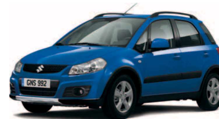
KASHMIR BLUE PEARL METALLIC