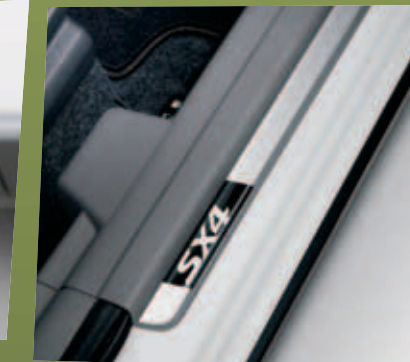
DOOR SILL TRIM SET