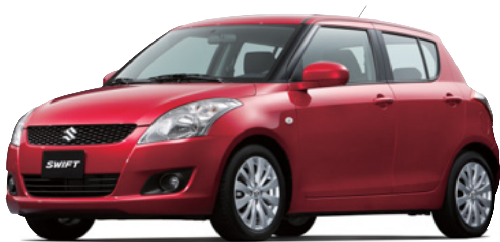
Ablaze Red Pearl 2 (ZRJ)