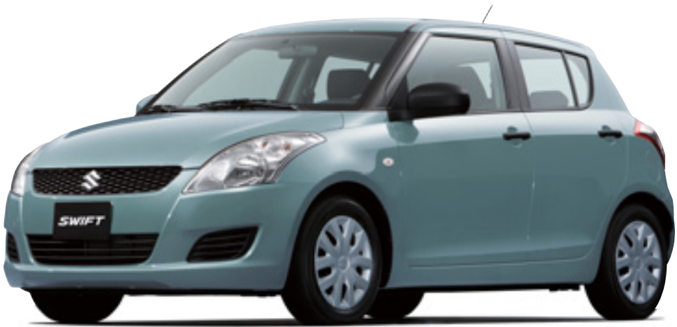
Smoky Green Metallic 2 (ZRL)