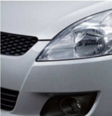
Star Silver Metallic (ZMU)