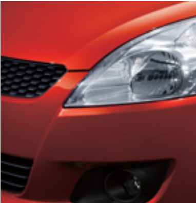
Sunlight Copper Pearl Metallic 2 (ZFM)