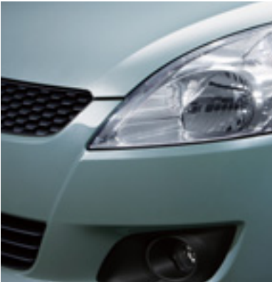
Smoky Green Metallic 2 (ZRL)