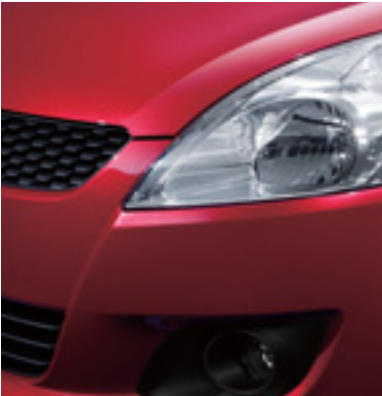
Ablaze Red Pearl 2 (ZRI)