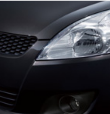
Super Black Pearl (ZMV)