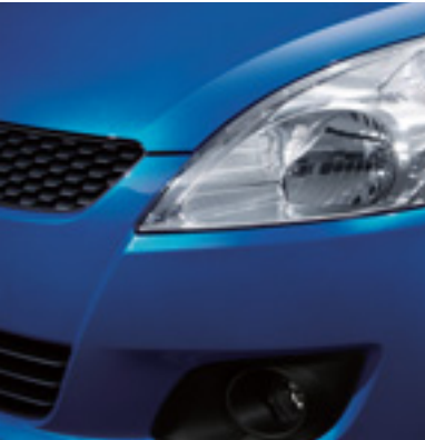
Boost Blue Pearl Metallic (ZRZ)