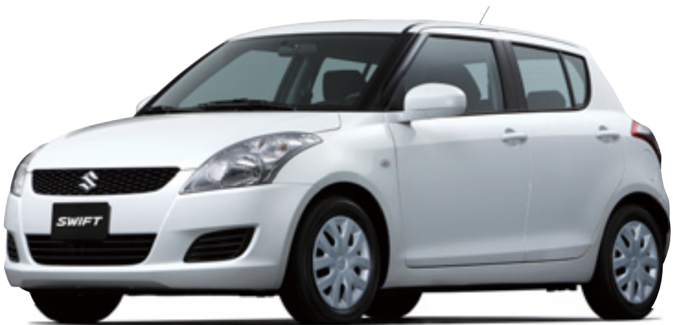
Snow White Pearl (ZMT)