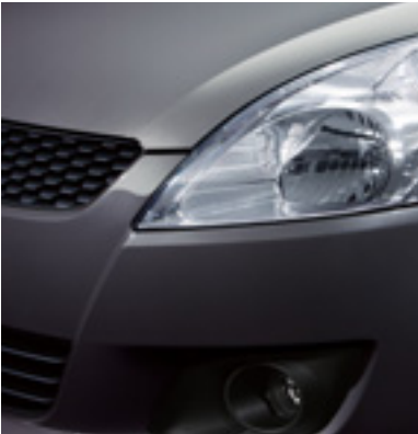
Mineral Gray Metallic (ZMW)