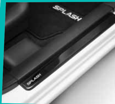
PIANO BLACK DOOR SILL TRIM SET