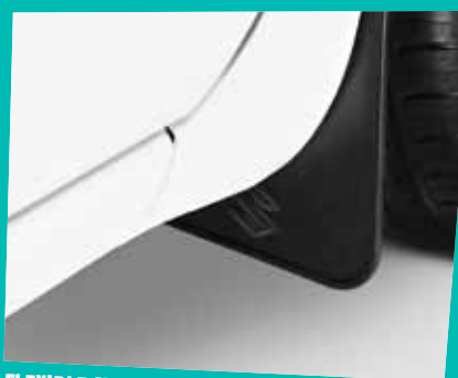
FLEXIBLE MUDFLAP SET