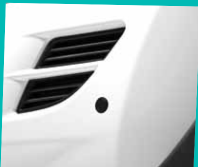
REVERSING AID SENSOR KIT