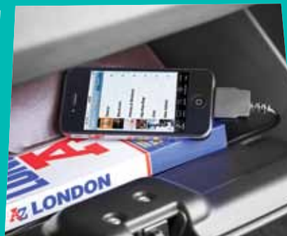
iPOD CONNECTOR KIT