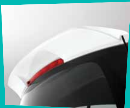
REAR UPPER SPOILER