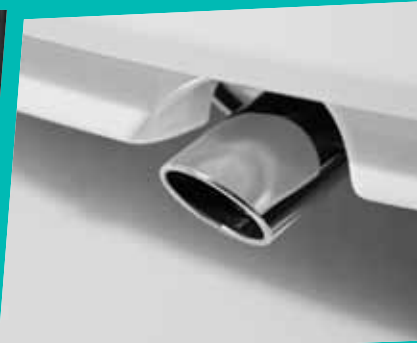
CHROMED MUFFLER EXTENSION