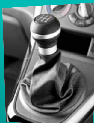
LEATHER GEAR KNOB AND BOOT