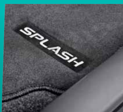
DELUXE CARPET MAT SET