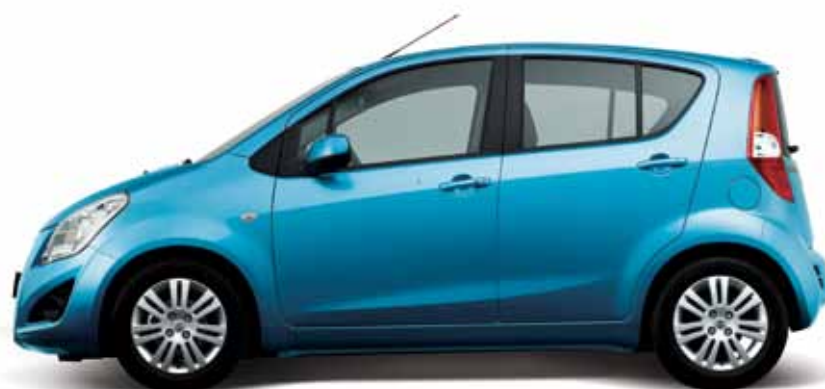
SPARKLING BLUE METALLIC