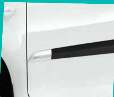
SIDE BODY MOULDING SET