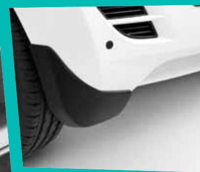
MOULDED MUDFLAP SET