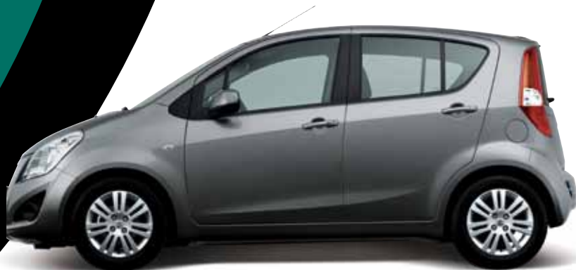
GALACTIC GREY METALLIC