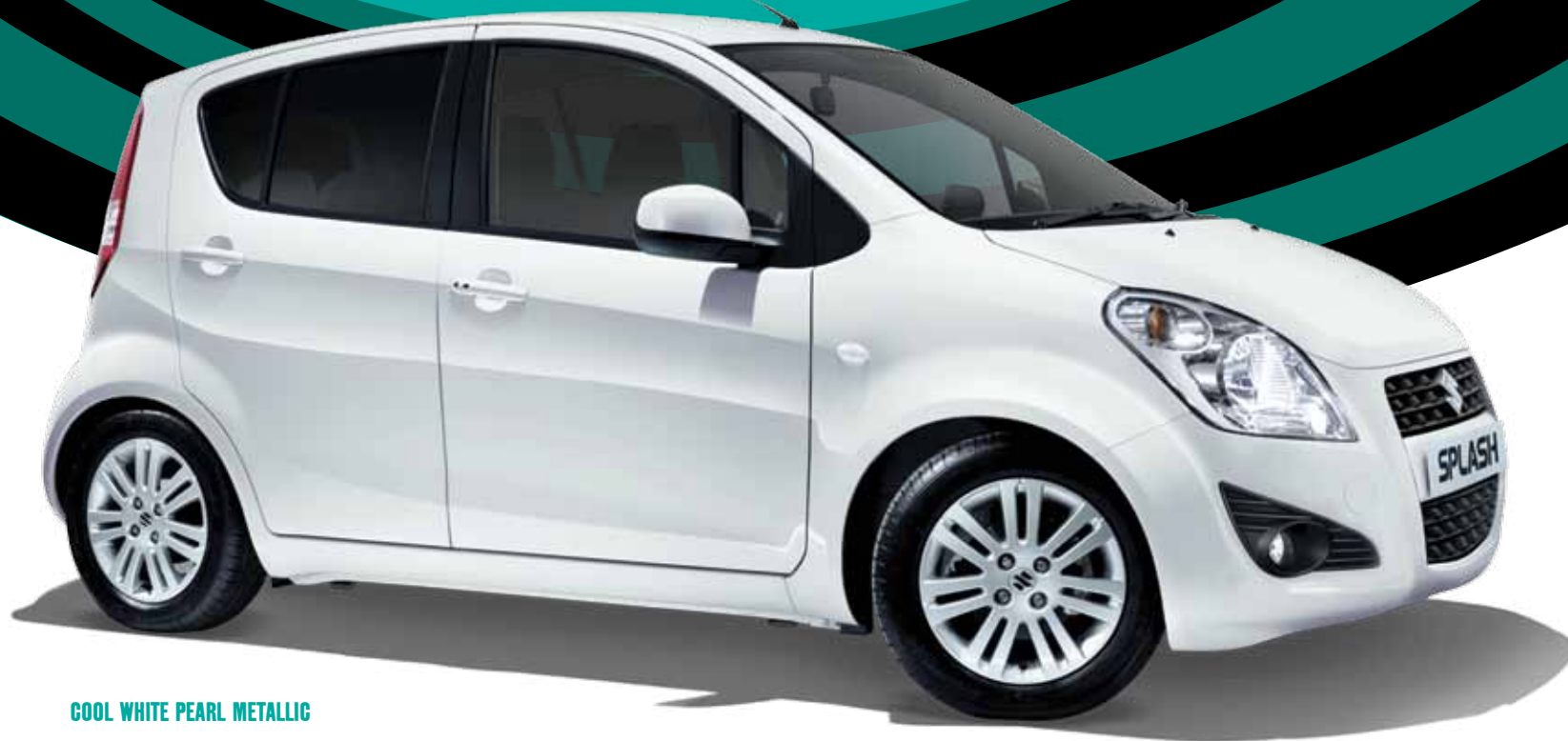
COOL WHITE PEARL METALLIC

COLOURS THAT MAKE A STATEMENT from every angle.