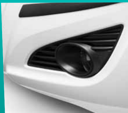
FOG LAMP SET (SUITABLE FOR S22)