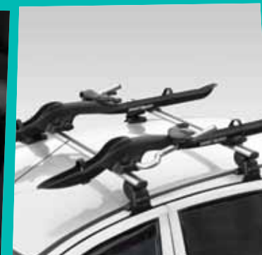
MULTI ROOF RACK AND BIKE MODULE