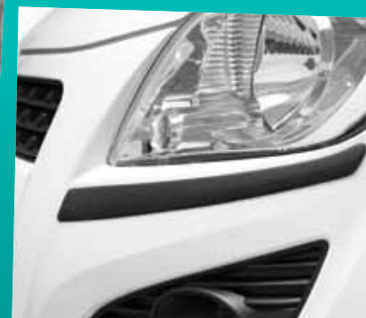
BUMPER CORNER PROTECTOR SET