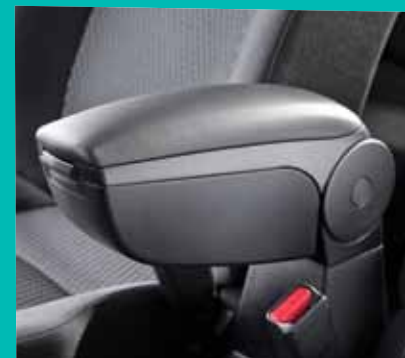
CENTRE ARMREST INCLUDING CD STORAGE