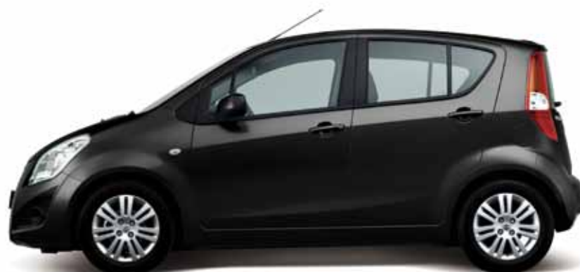
COSMIC BLACK PEARL METALLIC