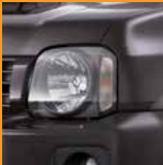
Quasar Grey Metallic