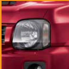
Phoenix Red Pearl