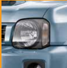
Breeze Blue Metallic