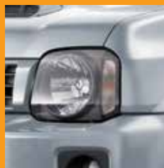
Silky Silver Metallic