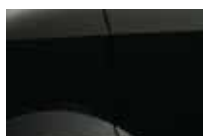
Real Black (ZBC)