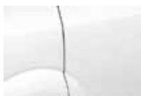
Superior White (26U)