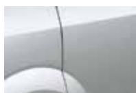
Silky Silver Metallic (Z2S)