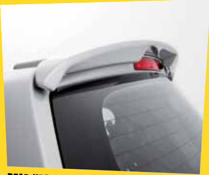
REAR UPPER SPOILER