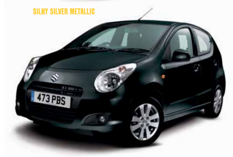
MIDNIGHT BLACK PEARL METALLIC