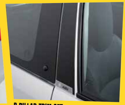
B PILLAR TRIM SET