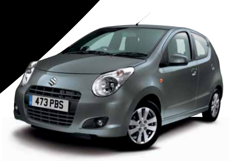
GLISTERING GREY METALLIC