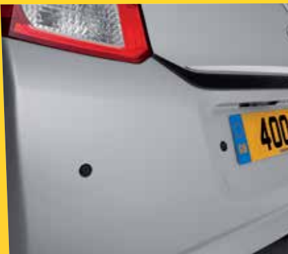
REVERSING AID SENSOR KIT