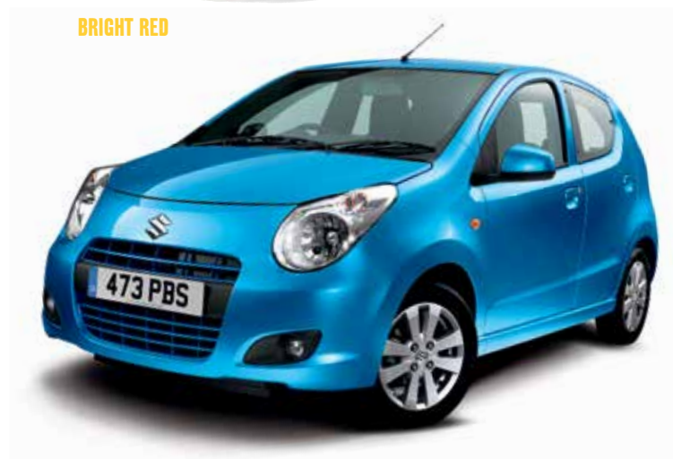
PARADISE BLUE PEARL METALLIC