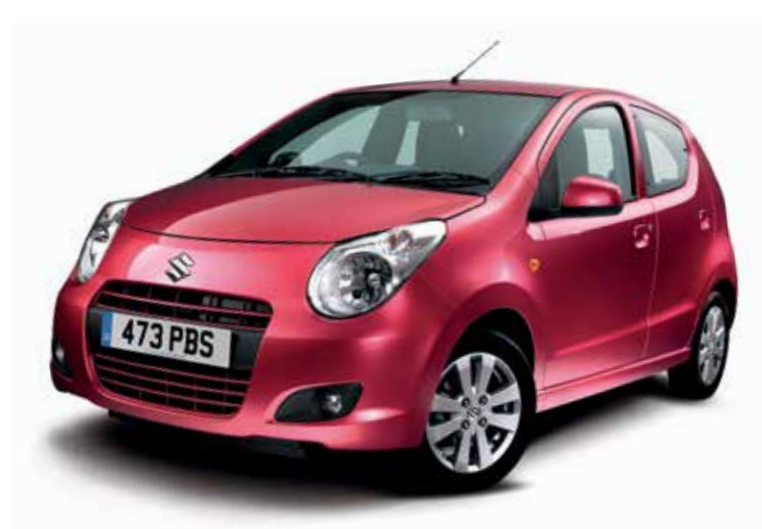
FORTUNE ROSE PEARL METALLIC