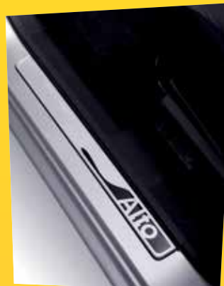
DOOR SILL TRIM SET