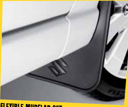
FLEXIBLE MUDFLAP SET