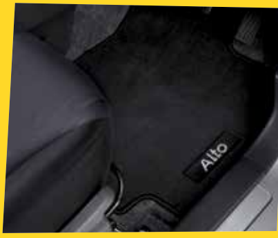
CARPET MAT SET