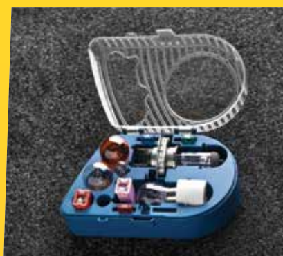
SPARE BULB AND FUSE KIT