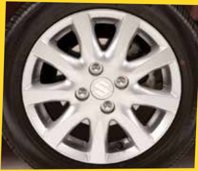
FARGO ALLOY WHEEL