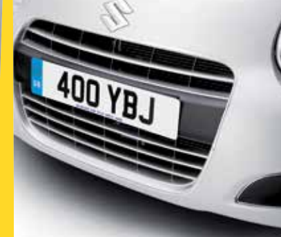
CHROMED GRILLE SURROUND