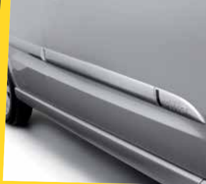
SIDE BODY MOULDING SET