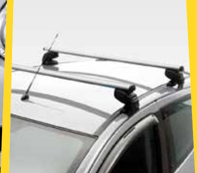
MULTI ROOF RACK