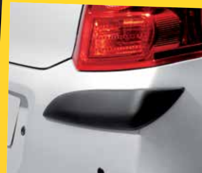
BUMPER CORNER PROTECTION SET