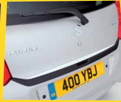
REAR BUMPER TOP GUARD