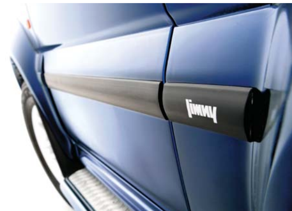
Side body moulding set