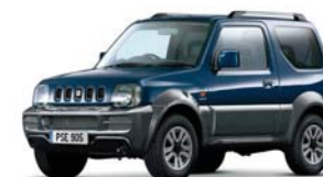
Nocturne Blue Pearl Metallic / Graphite Grey Metallic**