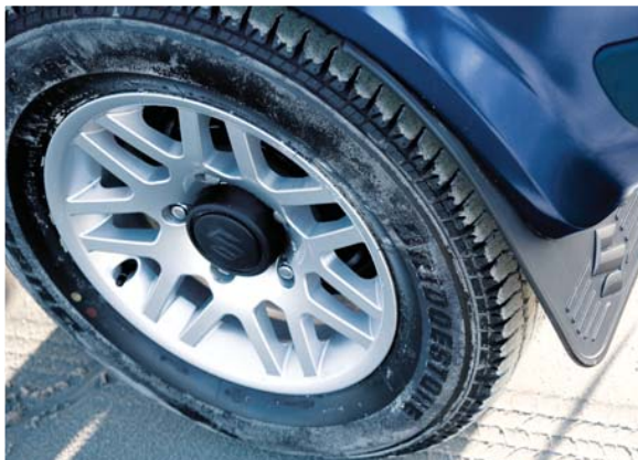
Jakarta alloy wheel