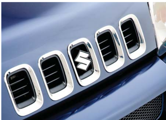
Front grille trim set