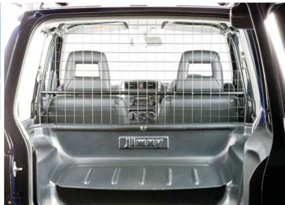
Partition grille/Dog guard