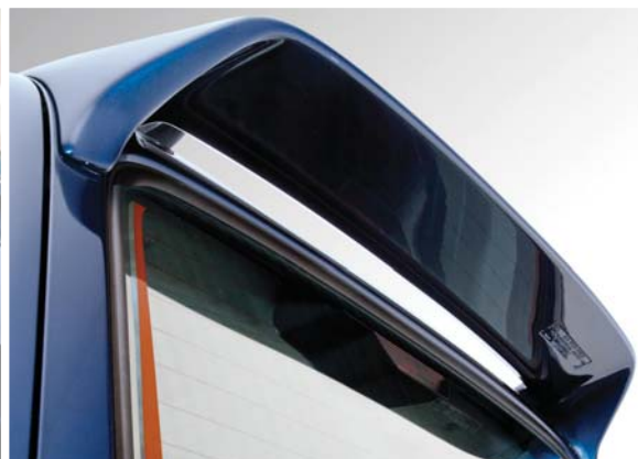
Rear upper spoiler