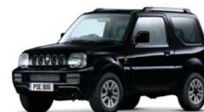
Blueish Black Pearl Metallic*