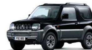
Blueish Black Metallic / Graphite Grey Metallic**