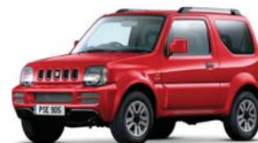
Phoenix Red Pearl Metallic*