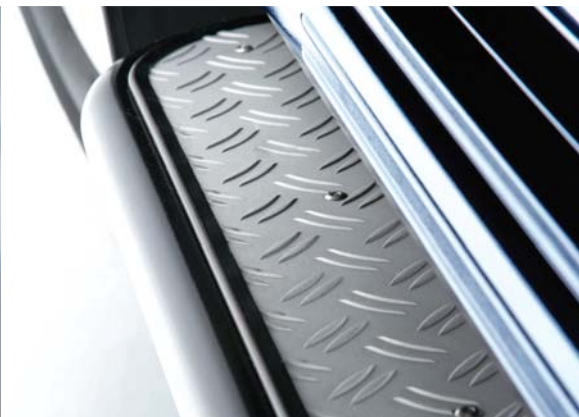
Stainless steel side step