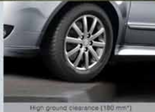
High ground clearance (180 mm*)