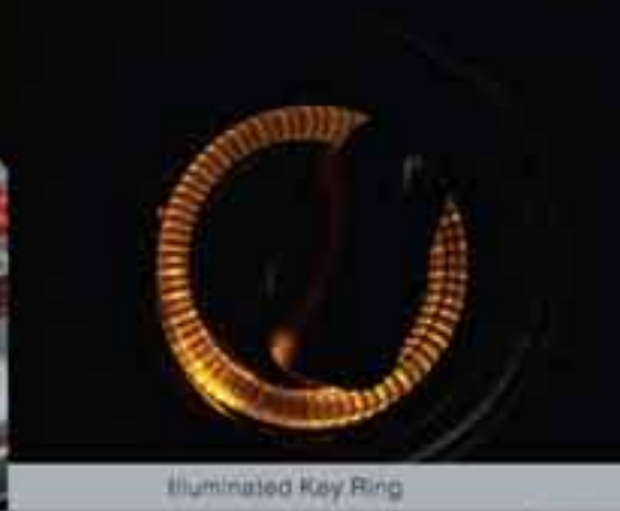
Illuminated Key Ring