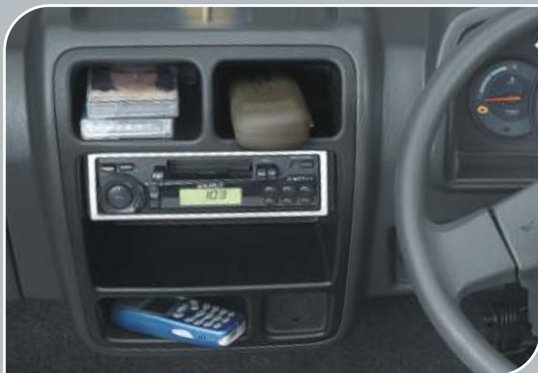
SMART CENTRE CONSOLE WITH USEFUL SPACES