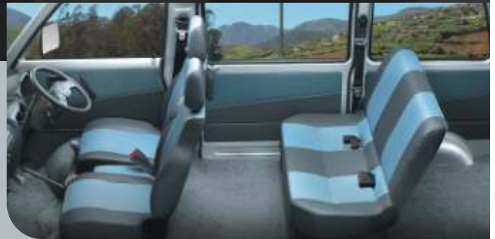
SPACIOUS EIGHT-SEATER AND FIVE-SEATER ARRANGEMENTS

The new Omni is amazingly good-looking. The attractive new two-tone upholstery brings elegance and comfort. And the spaciousness makes it incredibly versatile. Welcome aboard!