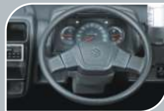
DYNAMIC STEERING WHEEL