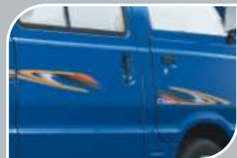
SLEEK SIDE-BODY GRAPHICS