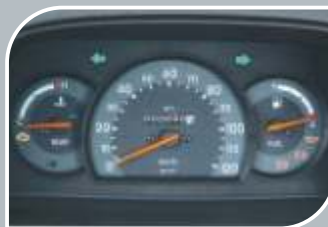
TRENDY INSTRUMENT CLUSTER