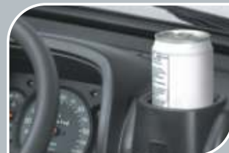
HANDY & CONVENIENT CUP-HOLDER