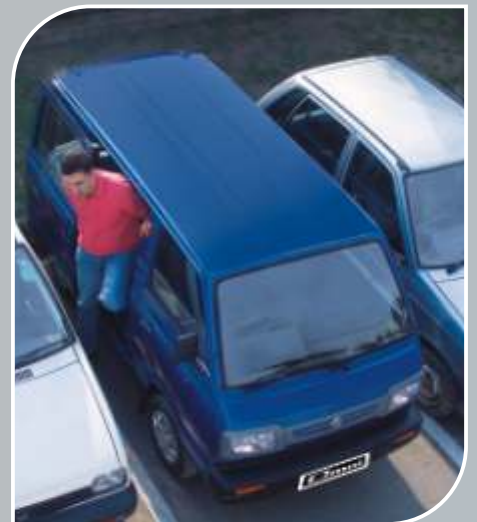
PRACTICAL SLIDING DOORS Be it narrow lanes or tight parking spots, the sliding doors are a blessing.