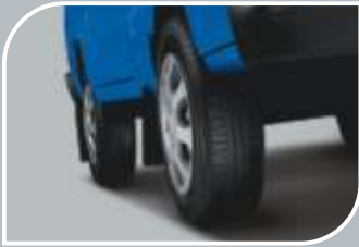
ROBUST RADIAL TYRES FOR EXTRA STRENGTH AND DURABILITY