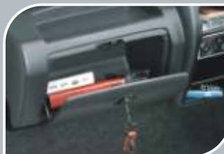
SUPER-SAFE LOCKABLE GLOVE BOX