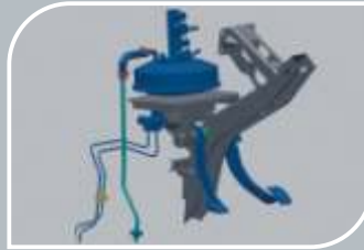
BOOSTER ASSISTED FRONT DISC BRAKES FOR ADDED SAFETY