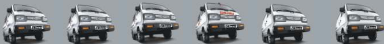
OMNI 5 SEATER