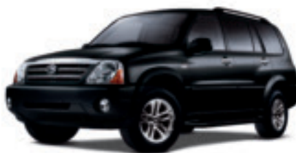
PEARL BLACK METALLIC