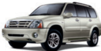
PEARL WHITE METALLIC