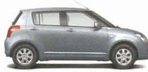
Metallic Azure Grey