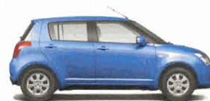
Metallic Beam Blue