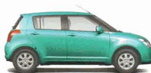
Metallic Mint Frappe