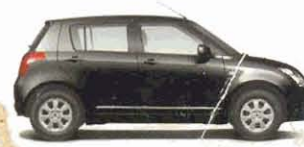
Metallic Midnight Black