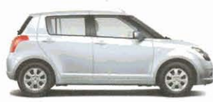
Metallic Silky Silver