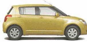
Metallic Crystal Gold