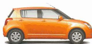
Metallic Garnet Orange