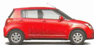
Solid Bright Red

Colours shown may vary from actual body colours due to printing on paper