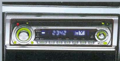
MP3 PLAYER CUM STEREO WITH POWER ANTENNA