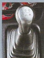
SPORTY GEAR STALK