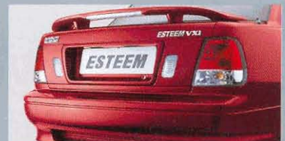
STYLISH AERODYNAMIC SPOILER & CLEAR LENS COMBINATION LAMPS