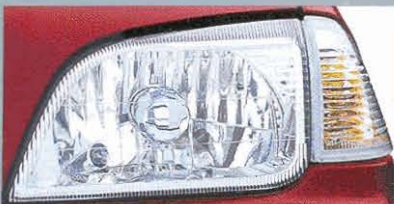
SPARKLING CLEAR LENS HEADLAMPS