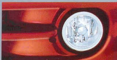
FRONT FOG LAMPS