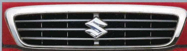
ELEGANT CHROME FRONT GRILLE