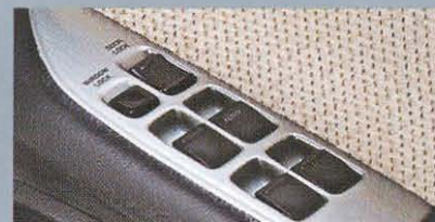
SILVER FINISHED POWER WINDOW SWITCH GARNISH