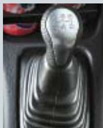
SPORTY GEAR STALK