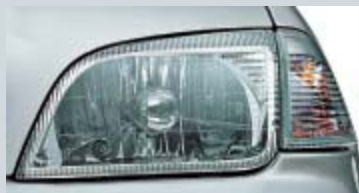
SPARKLING CLEAR LENS HEADLAMPS