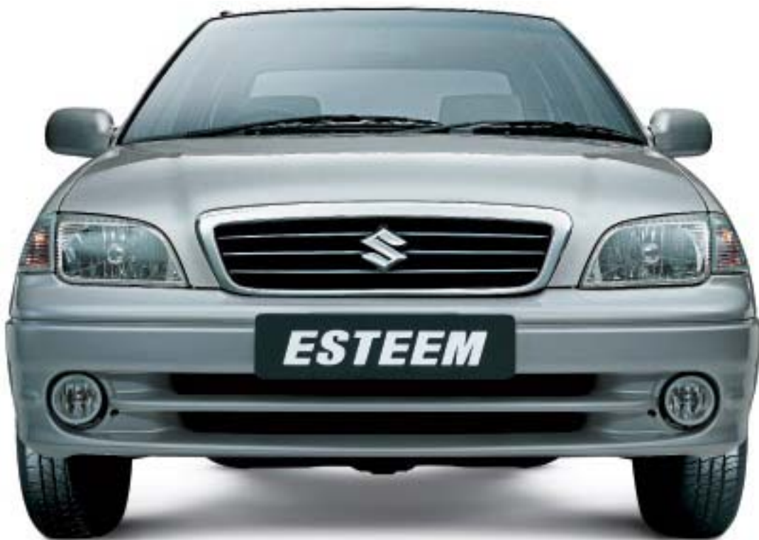
Esteem VXi featured here.

The Esteem has always been a striking presence with its handsome, sculpted form and refined features. But now with its redesigned, strikingly stylish looks, it redefines sophistication. A sportier muscular stance, a raised noseline and aerodynamic shape give it a distinctly bolder look. Plush new upholstery and brushed silver finished interiors with an inspiring new rear, complete the visual package. It's love at just a glance.