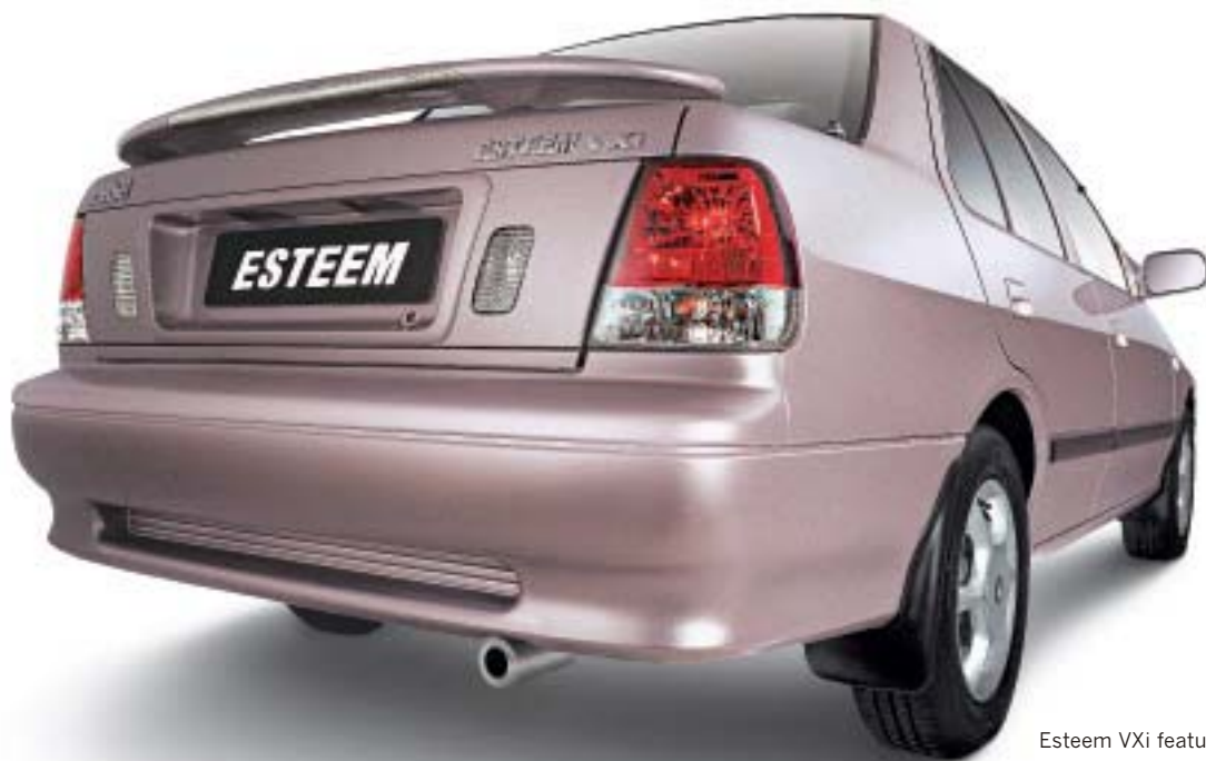
Esteem VXi featured here.