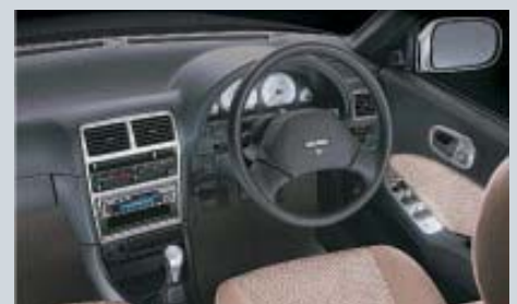
ERGONOMICALLY DESIGNED DASHBOAARD AND CONTROL FOR STRAIN FREE VIEWING AND EASY OPERATIONS