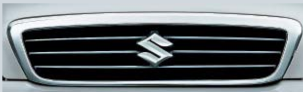
ELEGANT CHROME FRONT GRILLE