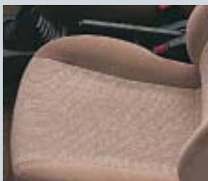
PLUSH NEW UPHOLSTERY

The cabin has been substantially refreshed to make every surface, every touch even more pleasing to the senses. The gauges are illuminated white and positioned for easy viewing. The ergonomically designed controls and low fatigue seats promise an unexpected level of comfort. While the super cool air-conditioning makes every journey a pleasure. So, get ready to get cosy.