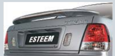
NEW REAR COMBINATION LAMPS WITH CLEAR LENS