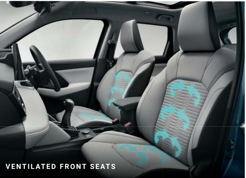
VENTILATED FRONT SEATS