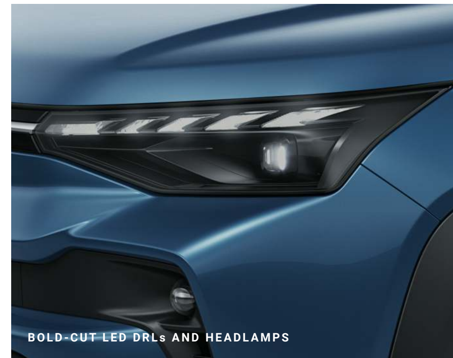
BOLD-CUT LED DRLs AND HEADLAMPS