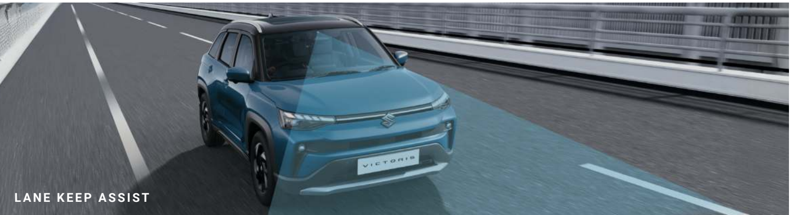
LANE KEEP ASSIST