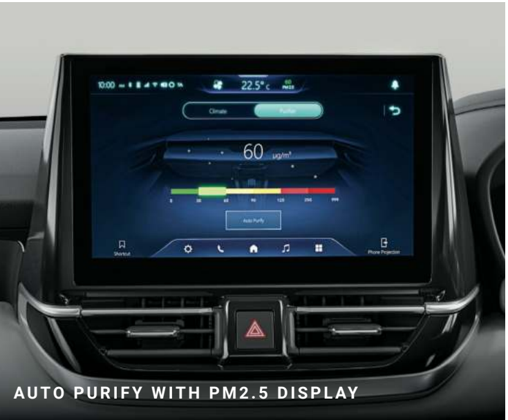
AUTO PURIFY WITH PM2.5 DISPLAY