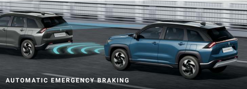
AUTOMATIC EMERGENCY BRAKING