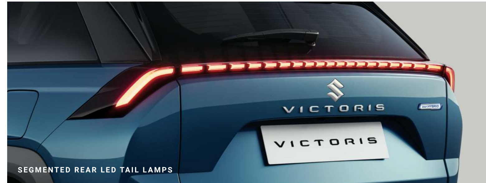
SEGMENTED REAR LED TAIL LAMPS

The Victoris speaks in a design language that's impossible to ignore. Its sweeping silhouette and sculpted lines create a stance that's dynamic when in motion and commanding when still. The seamless tail light stretches across the rear, leaving a signature that lingers long after it's gone.