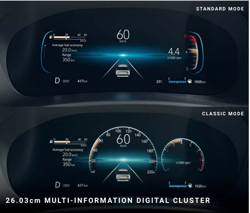
26.03cm MULTI-INFORMATION DIGITAL CLUSTER