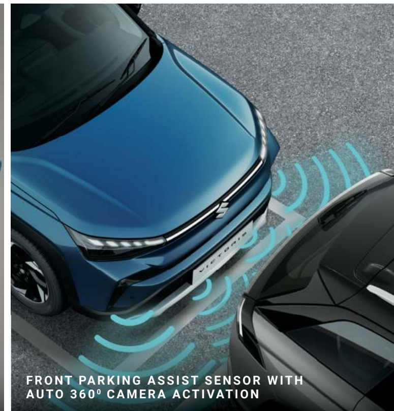
FRONT PARKING ASSIST SENSOR WITH AUTO 360° CAMERA ACTIVATION