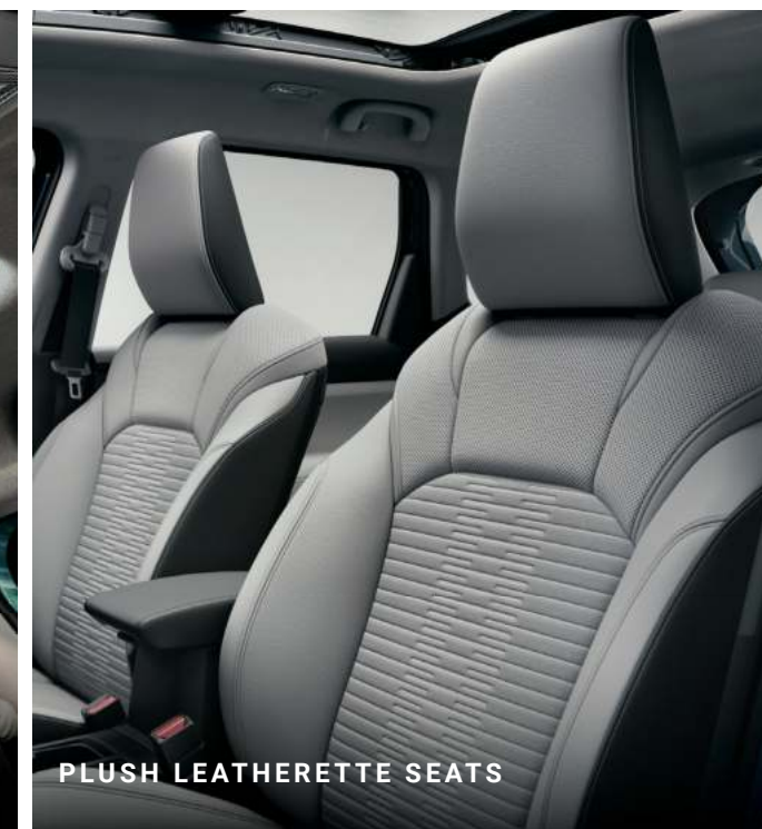
PLUSH LEATHERETTE SEATS