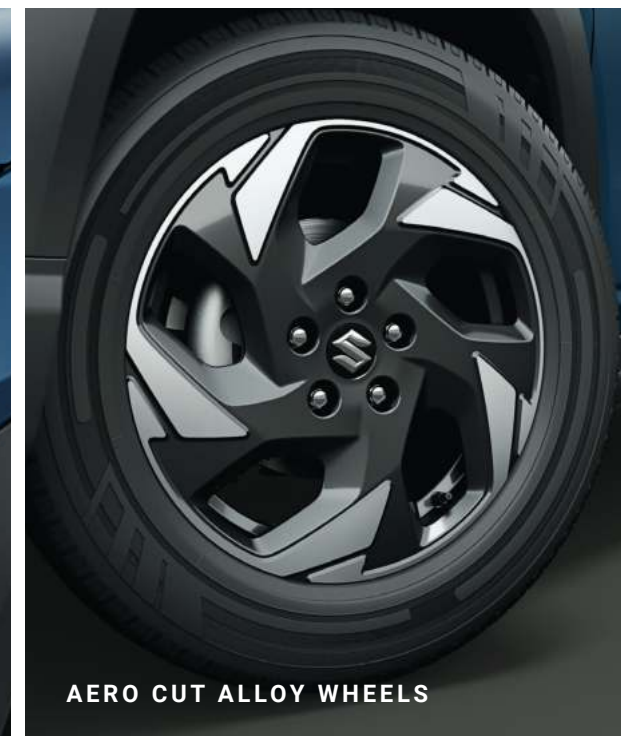
AERO CUT ALLOY WHEELS