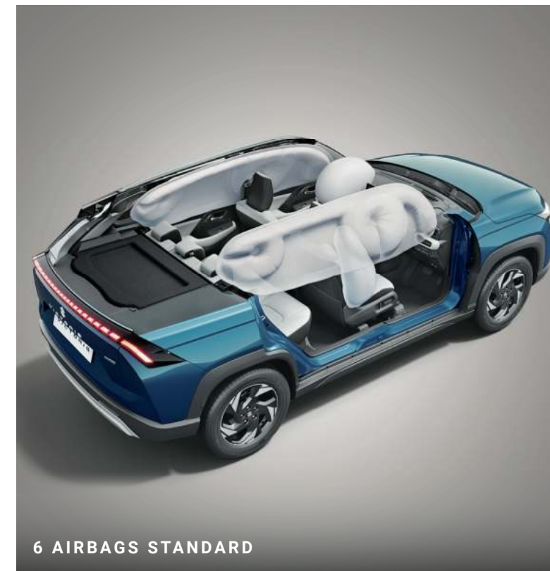
6 AIRBAGS STANDARD

Safety is more than just a feature. It's a promise. It's the quiet assurance that's inherent to every aspect of the Victoris. Where advanced driver-assist technology works seamlessly with intuitive features to create a drive that feels unshakably secure. So, while the road may throw its share of surprises, you stay confidently in control.