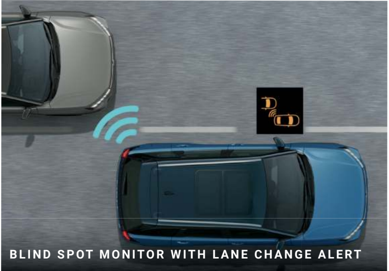
BLIND SPOT MONITOR WITH LANE CHANGE ALERT