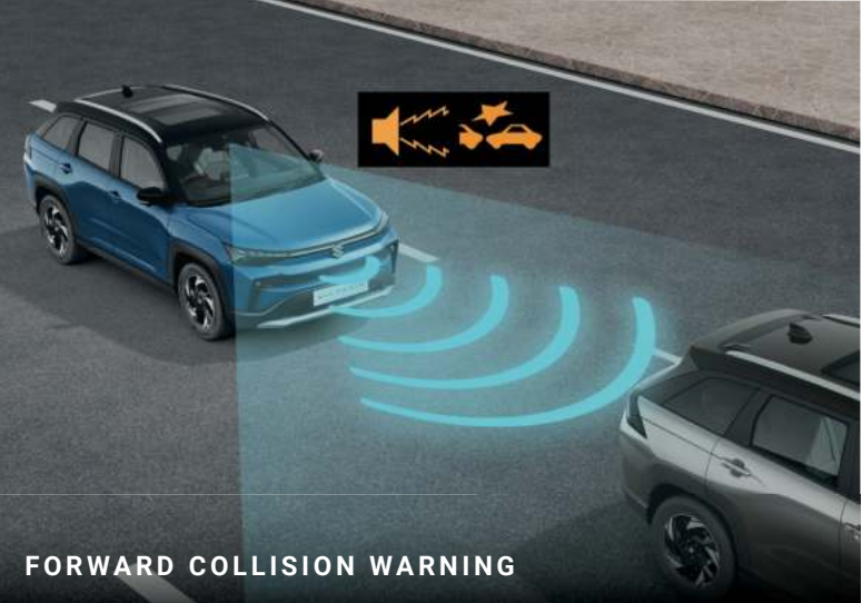
FORWARD COLLISION WARNING