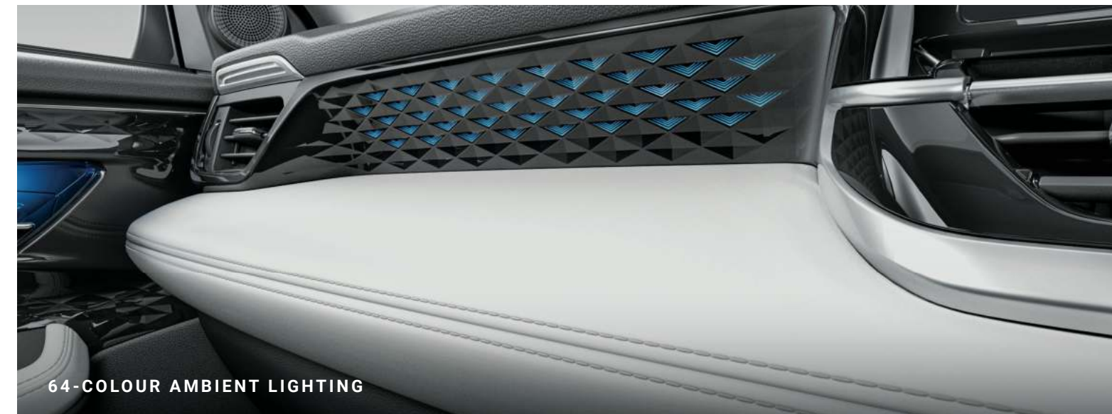
64-COLOUR AMBIENT LIGHTING

Its expansive design with dual-tone interiors, panoramic sunroof, vibrant 64-colour ambient lighting, right down to the elegant three-level dashboard with precision stitching; creates a space that serenades all your senses.