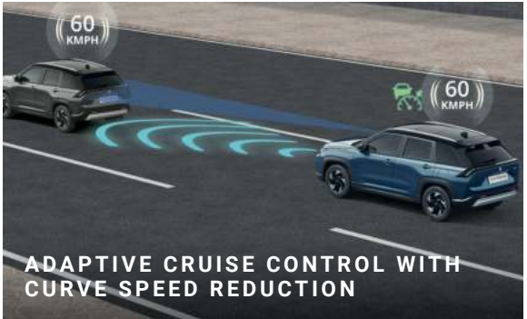
ADAPTIVE CRUISE CONTROL WITH CURVE SPEED REDUCTION