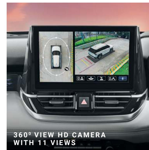
360° VIEW HD CAMERA WITH 11 VIEWS