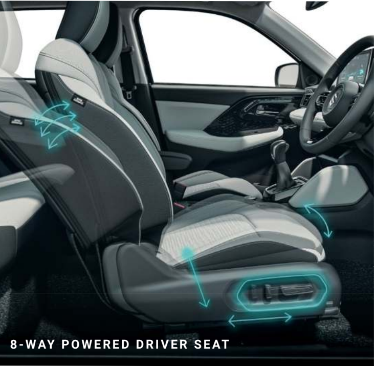
8-WAY POWERED DRIVER SEAT

In the Victoris, comfort begins long before the journey does. It starts the moment you settle in. The cool embrace of the ventilated seats. The effortless reach of every control. Every aspect of the Victoris adjusts to your personalised comfort to ensure that the road ahead feels less like travel and more like an experience.