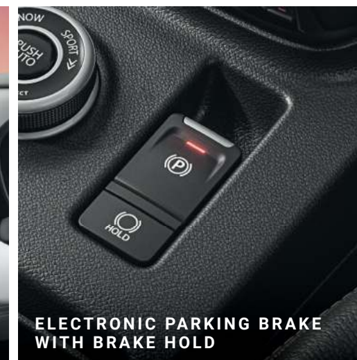
ELECTRONIC PARKING BRAKE WITH BRAKE HOLD