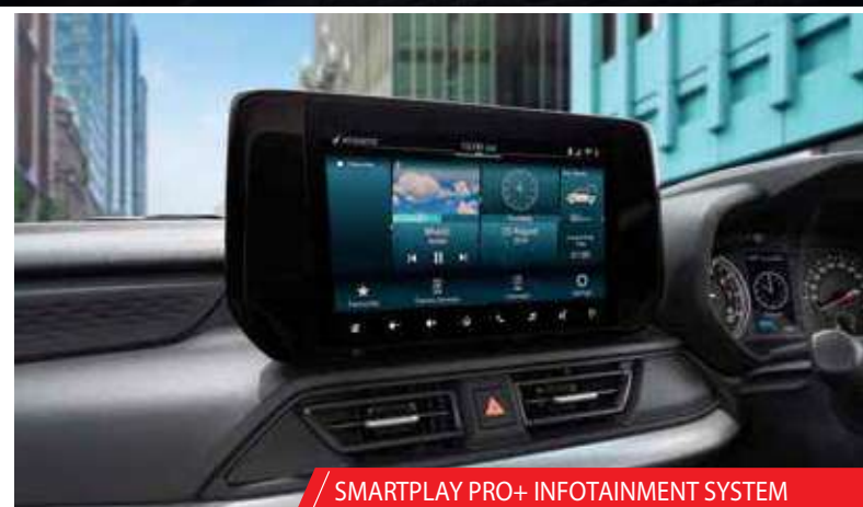
SMARTPLAY PRO+ INFOTAINMENT SYSTEM

No words can describe what you'll feel when you enter the Epic New Swift. But we'll try. This car is designed with ample space keeping your comfort in mind and its Sporty All-Black Interiors make every drive truly stylish. The real head-turner is the sleek and futuristic center console, with a driver-oriented cockpit for easy access.