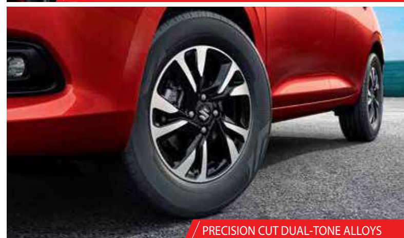
PRECISION CUT DUAL-TONE ALLOYS