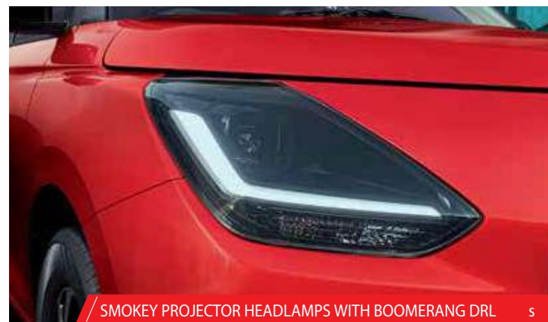
SMOKEY PROJECTOR HEADLAMPS WITH BOOMERANG DRL s

With its bold stance and sporty design, the Epic New Swift is quite the looker. It is pure passion crafted into an expression of thrill. As it approaches, heartbeats go up, and you know it is something special.