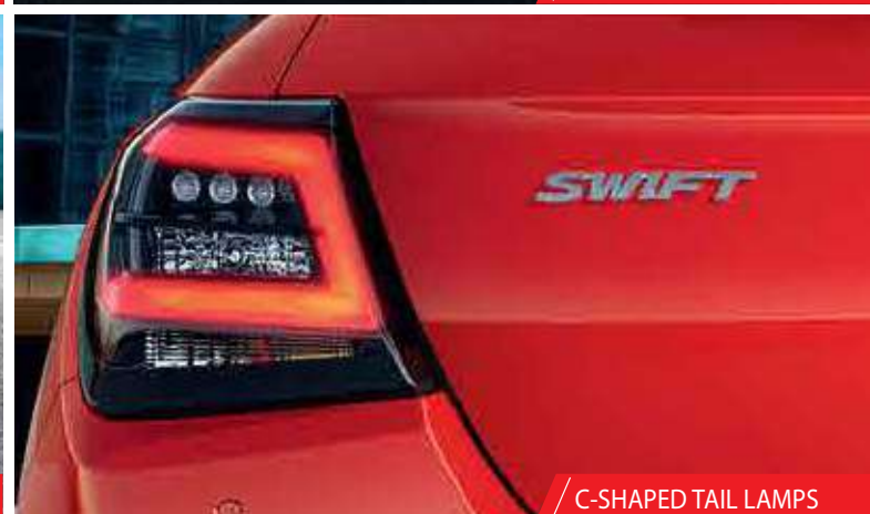
C-SHAPED TAIL LAMPS