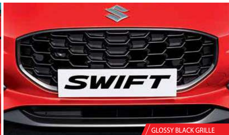
GLOSSY BLACK GRILLE