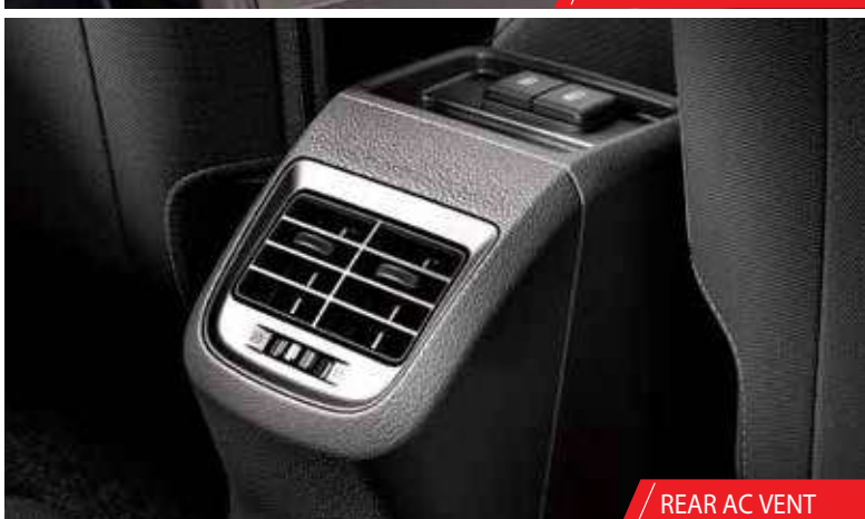
REAR AC VENT