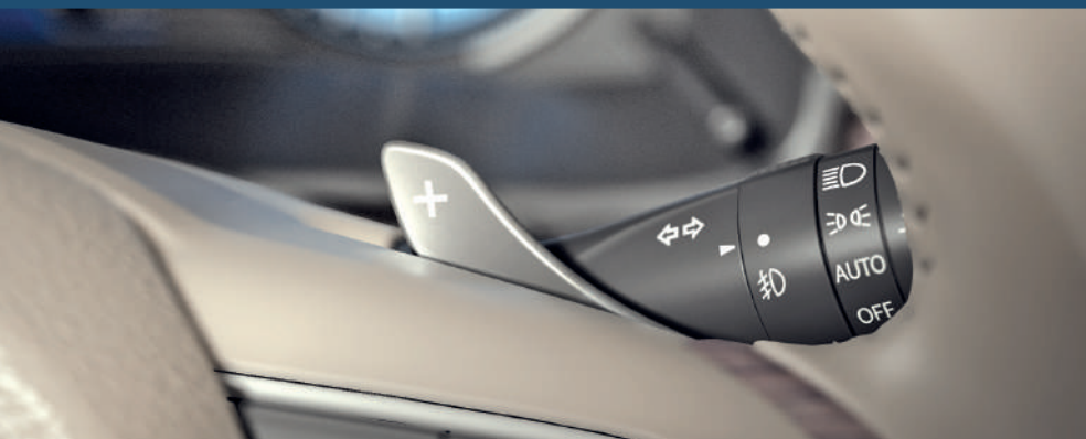
6-Speed AT with Paddle Shifters Surge ahead by engaging the smart paddle shifters.

● Togetherness, driven by technology. The Ertiga is equipped with state-of-the-art technology to add more fun to your moments of togetherness.