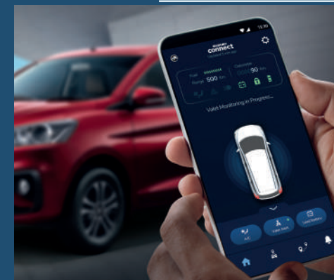
Connected Car Technology with Suzuki Connect Always stay connected with your car.