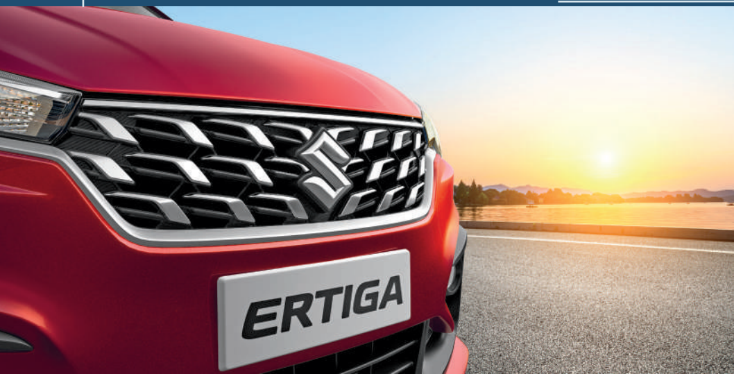
Dynamic Chrome Winged Front Grille The most stylish way to make an entrance.

● Elegant from every angle, the Ertiga is designed to bring out the stylish side of togetherness.