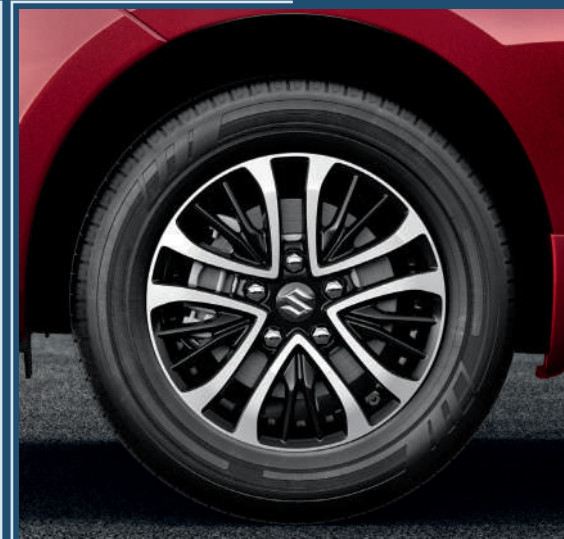
Machined Two-Tone Alloy Wheels Make a statement, every time.