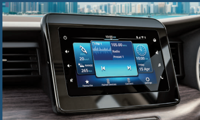
17.78cm Smartplay Pro Connect with your world with just a voice command - "Hi Suzuki".