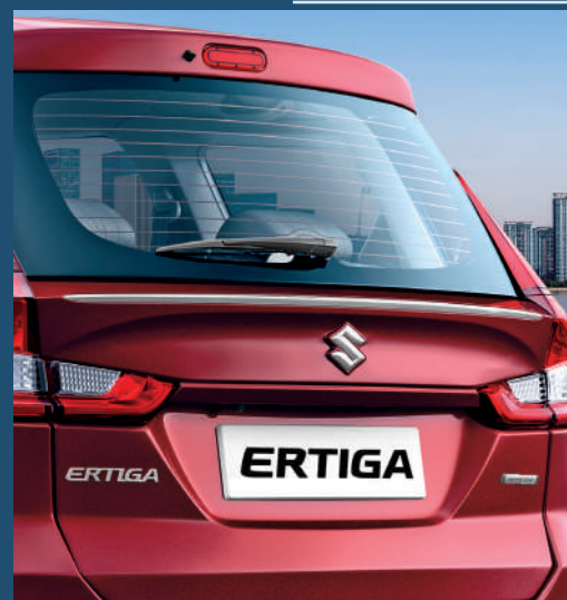
New Back Door Garnish with Chrome Insert Let those second looks chase you.