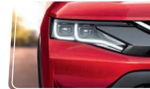
Dual LED Projector Headlamps with LED DRLs