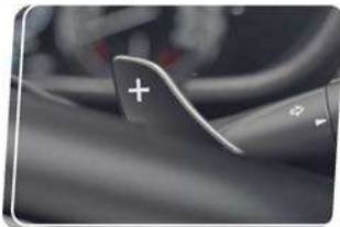
6-Speed AT with Paddle Shifters