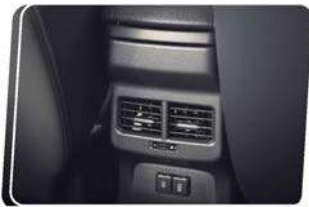
Rear AC Vents with Fast Charging USB Ports