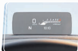
Head Up Display