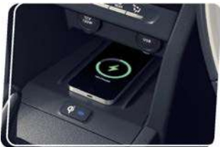
Wireless Charging Dock

The Hot and Techy Brezza carries a youthful and exciting appeal on the inside with your convenience at its core. It gets a unique design, modern and sleek look and black and brown interiors with silver accents for a sporty and urban feel. The City-Bred SUV also has Rear AC Vents, a Fast Charging USB Port (Type A and C) and a flat bottom Steering Wheel for your enhanced comfort and convenience. The 6-Speed Automatic Transmission with Paddle Shifters and Telescopic Steering ensure you go on city adventures comfortably.