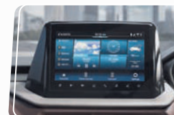
SmartPlay Pro+ with Surround Sense powered by ARKAMYS