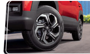
Bold Geometric Alloy Wheels

The Hot and Techy Brezza introduces a youthful and energetic design, ensuring you are ready for an adventurous drive in the city every day. Its commanding stance, impressive looks and precision detailing ensure that it never goes unnoticed. The City-Bred SUV comes with a clean Beltline with Bold Geometric Alloy Wheels, Dual Tone exteriors with a Shark Fin Antenna that enhances its design.