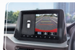
360 View Camera