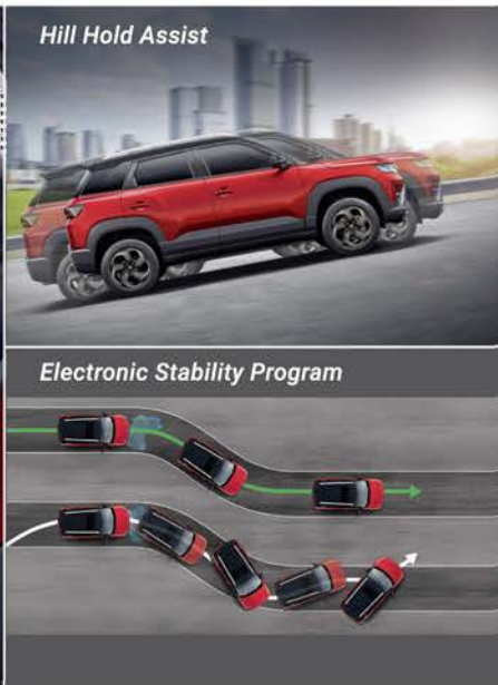
Hill Hold Assist