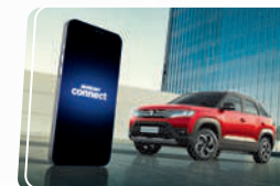
Next Gen Suzuki Connect