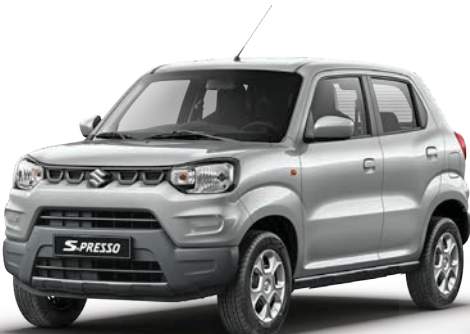
Metallic Silky Silver (ZZS)