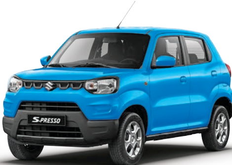
Pearl Starry Blue (ZZS)