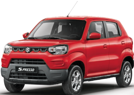
Fire Red (Z4Q)