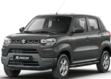
Metallic Granite Grey (ZTN)