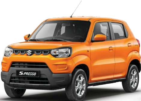
Sizzle Orange (ZZT)