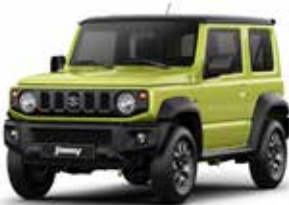
Kinetic Yellow + Bluish Black Pearl 3 (EG2)

■ Two-tone colours Three combinations of two-tone colouring are available