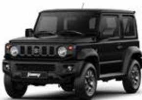
Bluish Black Pearl 3 (ZAM)