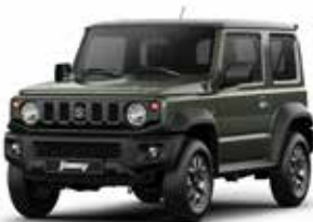
Jungle Green (WA7)

■ Single-tone colours Five basic colours are available as single-tone body colours