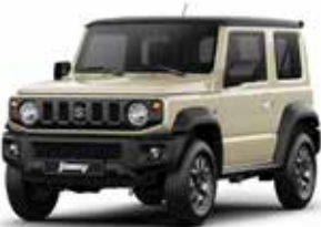
Chiffon Ivory Metallic + Bluish Black Pearl 3 (EG3)

■ Single-tone colours Five basic colours are available as single-tone body colours