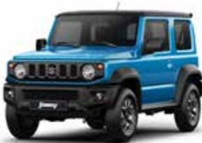
Brisk Blue Metallic + Bluish Black Pearl 3 (EH1)