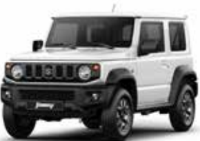
Superior White (Z6U)