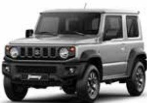
Silky Silver Metallic (Z2S)