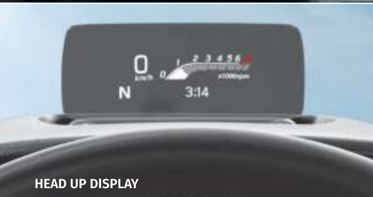
HEAD UP DISPLAY