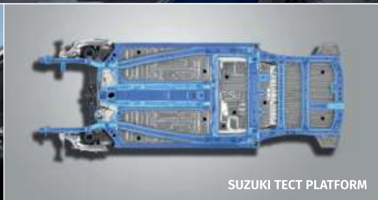
SUZUKI TECT PLATFORM