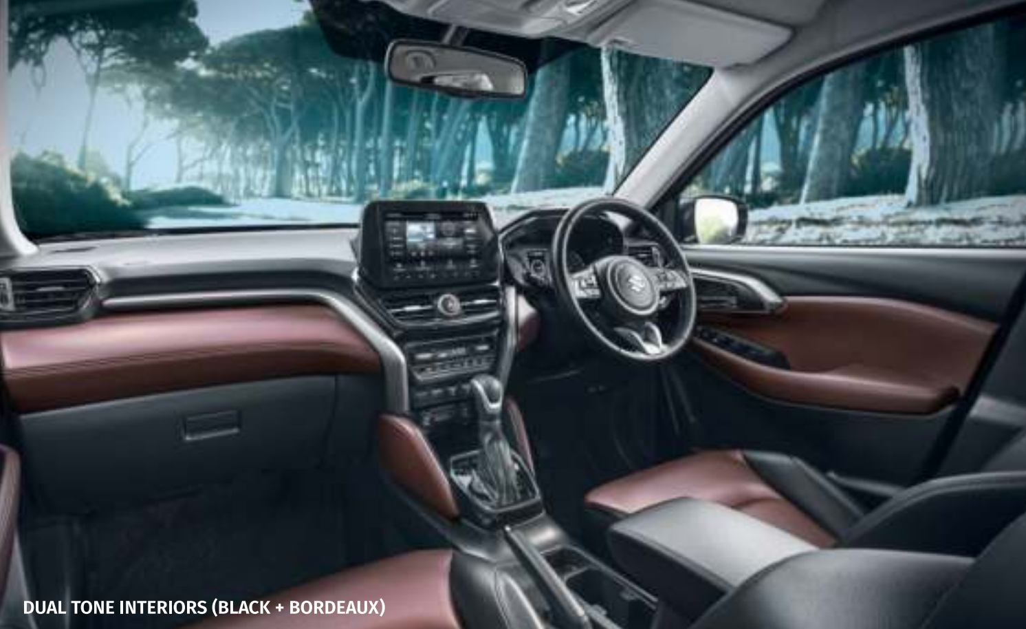
DUAL TONE INTERIORS (BLACK + BORDEAUX)