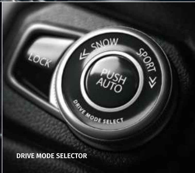
DRIVE MODE SELECTOR