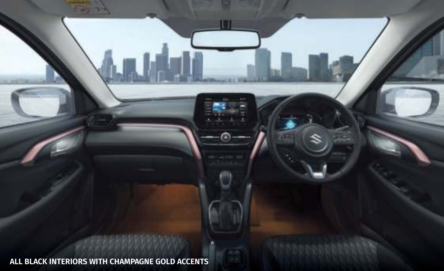
ALL BLACK INTERIORS WITH CHAMPAGNE GOLD ACCENTS