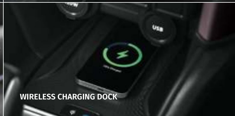
WIRELESS CHARGING DOCK