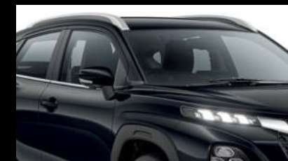
Bluish Black Pearl