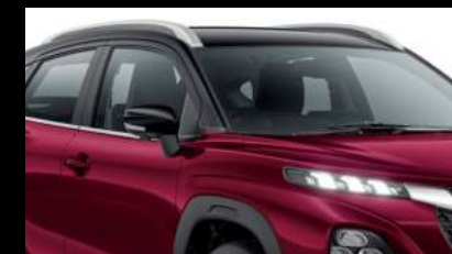
Opulent Red Pearl Metallic x Bluish Black Pearl