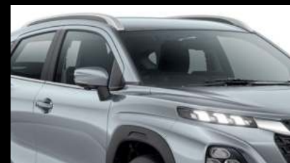
Splendid Silver Pearl Metallic