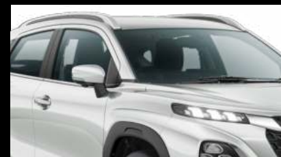
Arctic White Pearl