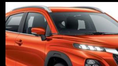
Lucent Orange Pearl Metallic