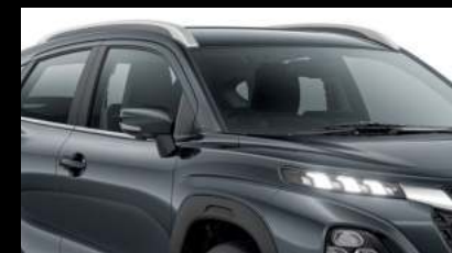
Grandeur Grey Pearl Metallic