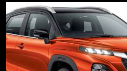
Lucent Orange Pearl Metallic x Bluish Black Pearl