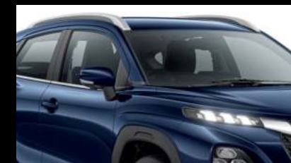
Celestial Blue Pearl Metallic