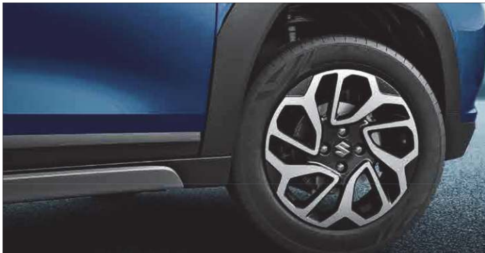
GEOMETRIC PRECISION CUT ALLOY WHEELS