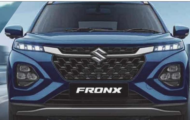
NEXWave GRILLE & STRIKING FRONT FASCIA