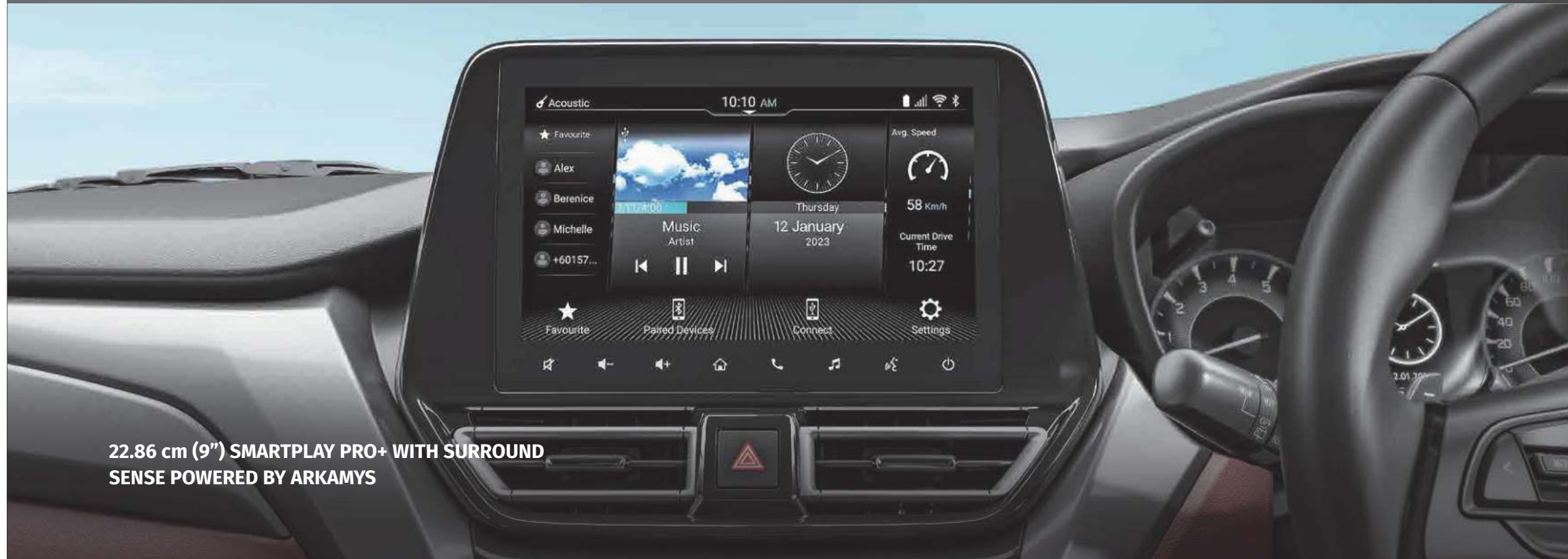
22.86 cm (9") SMARTPLAY PRO+ WITH SURROUND SENSE POWERED BY ARKAMYS

While FRONX is tuned to perform, it is also primed with technology. The 22.86 cm (9") SmartPlay Pro+ Infotainment System takes center stage and offers an HD display with acoustic pleasure at your fingertips. Couple that with the 360 View Camera, Wireless Charging, Heads-Up Display and Next-Gen Suzuki Connect — and you get an unparalleled driving experience, sharpened by technology.