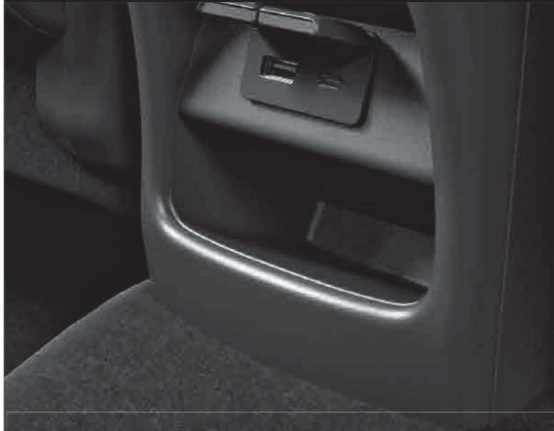
REAR FAST CHARGING USB