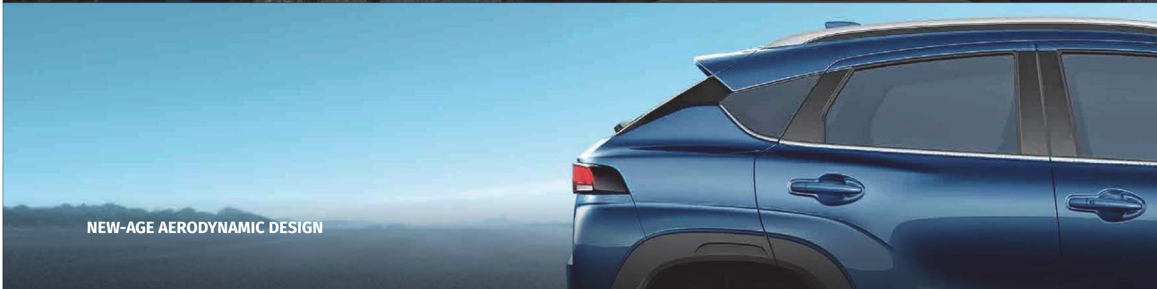
NEW-AGE AERODYNAMIC DESIGN