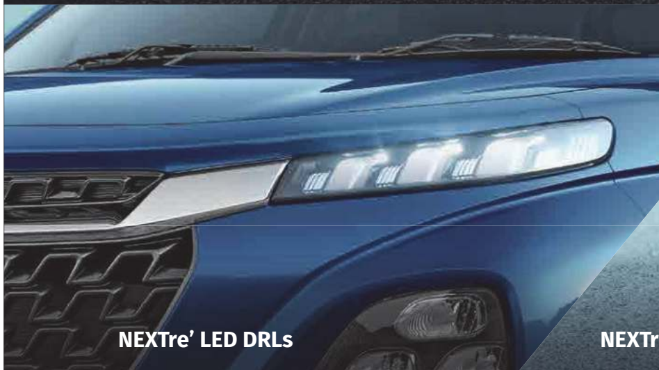
NEXTre' LED DRLs