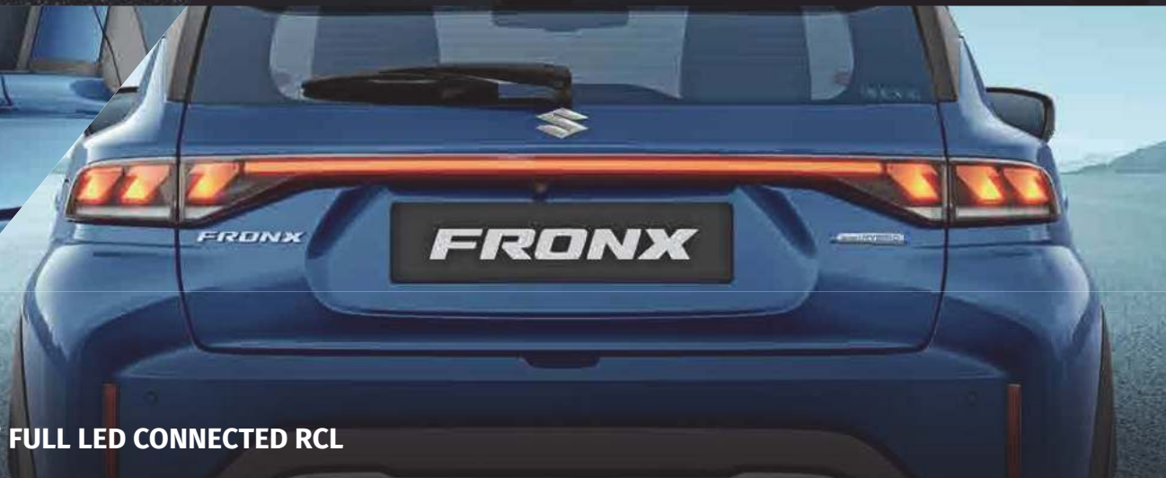
NEXTre' FULL LED CONNECTED RCL