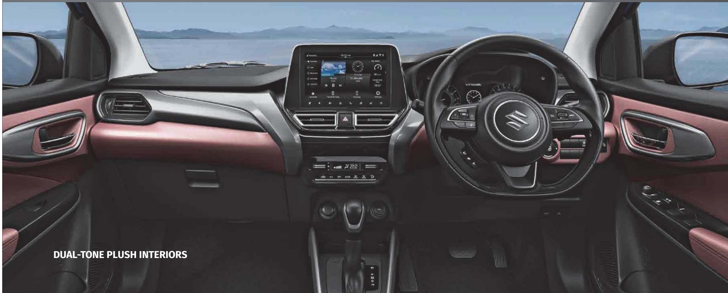
DUAL-TONE PLUSH INTERIORS

From the moment you step in, FRONX enhances the SUV experience with its structural precision and integrated function. The dual-tone dashboard with special forged metal finish and accents seamlessly connects the steering, infotainment system and rounds off the interiors in style. Cruise control and steering-mounted controls ensure you never have to take your hands off the wheel. What amps up the luxury for you, and yours, are details like the driver armrest; rear AC vents; and rear fast charging.