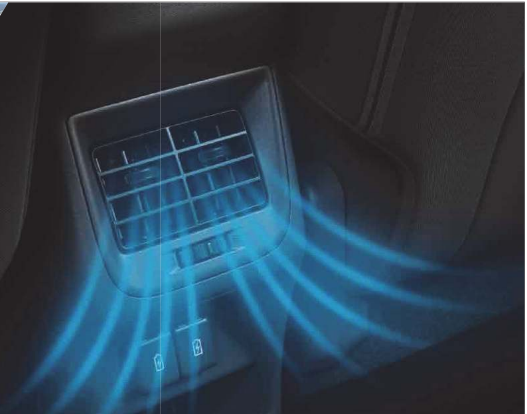
REAR AC VENTS