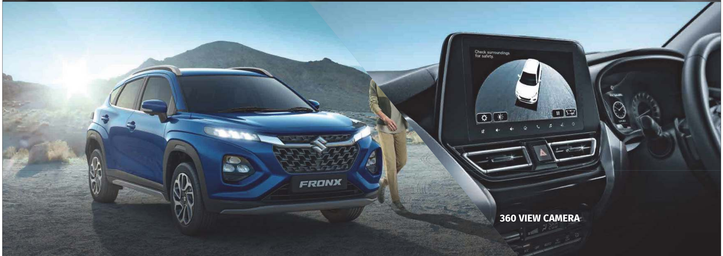
360 VIEW CAMERA