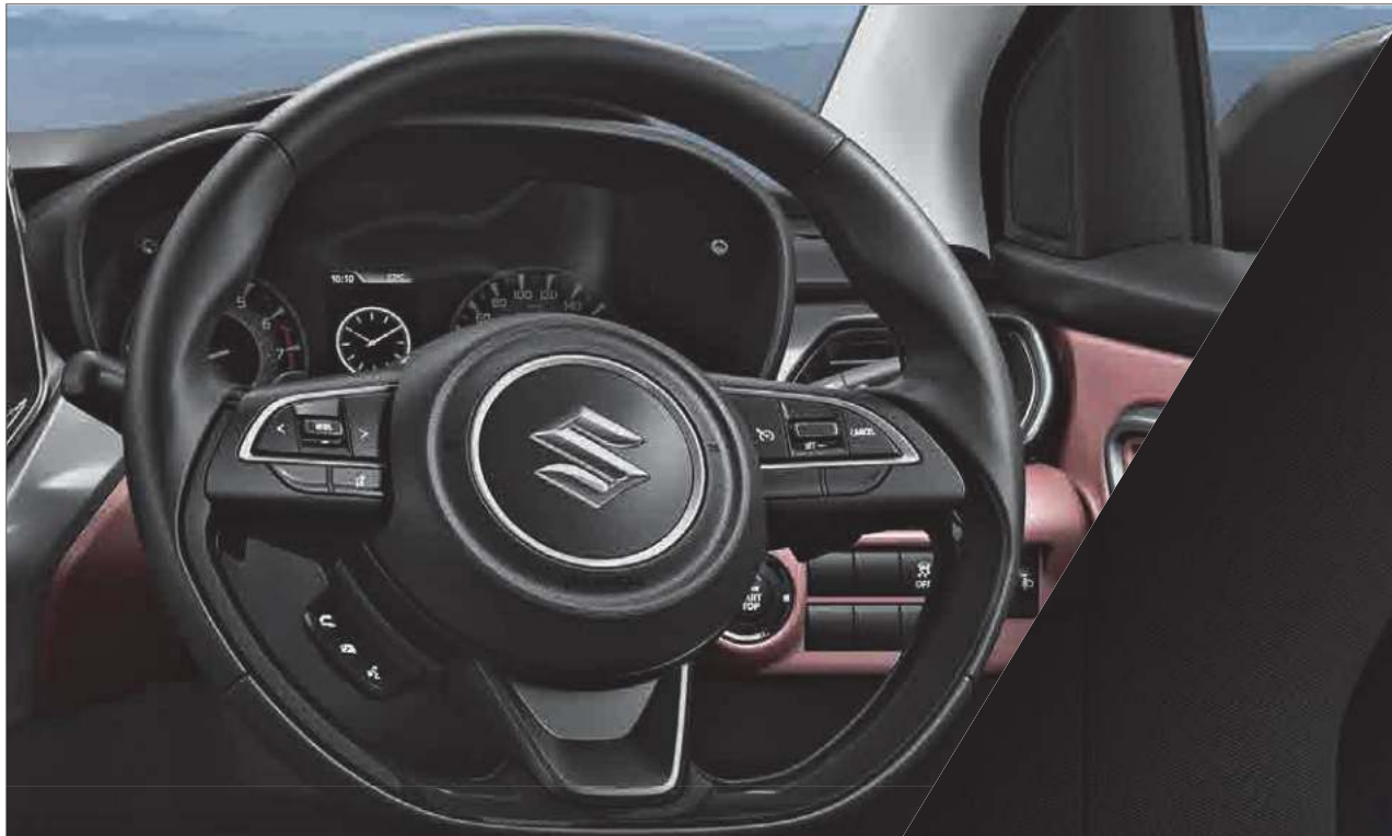
STEERING MOUNTED CONTROLS