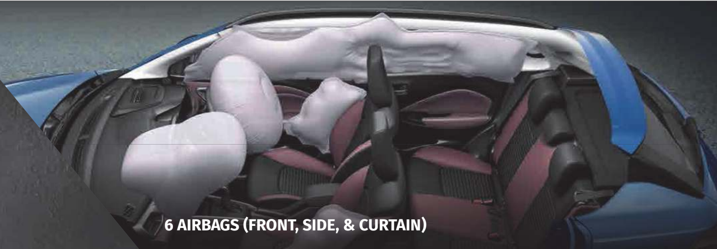
6 AIRBAGS (FRONT, SIDE, & CURTAIN)