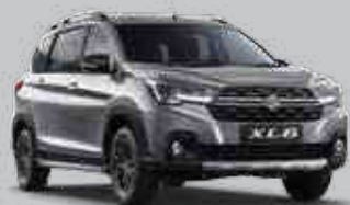
| PREMIUM SILVER