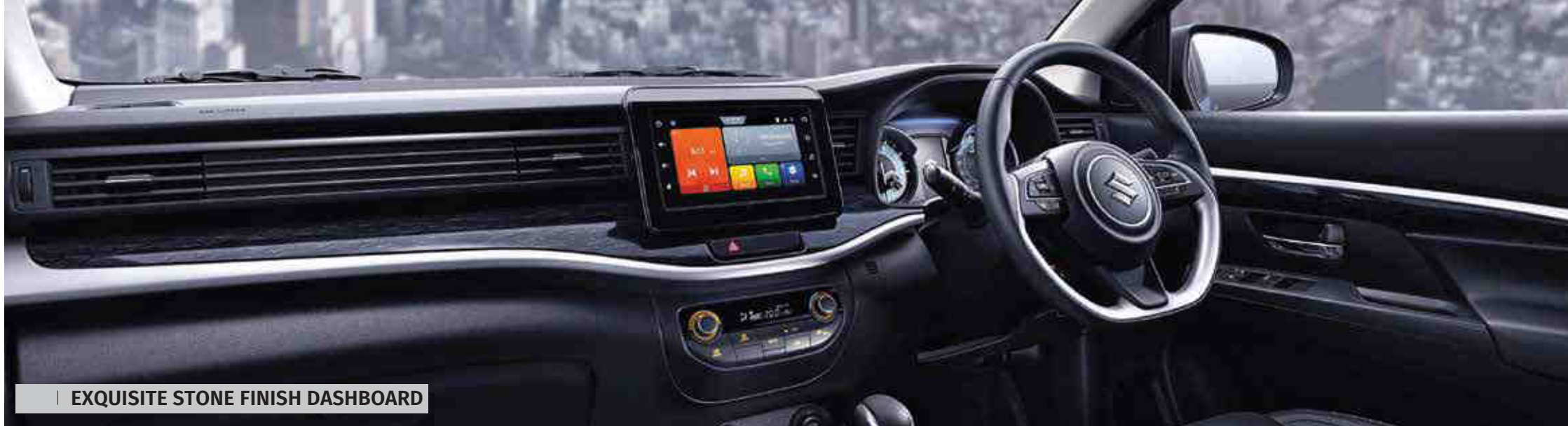
| EXQUISITE STONE FINISH DASHBOARD