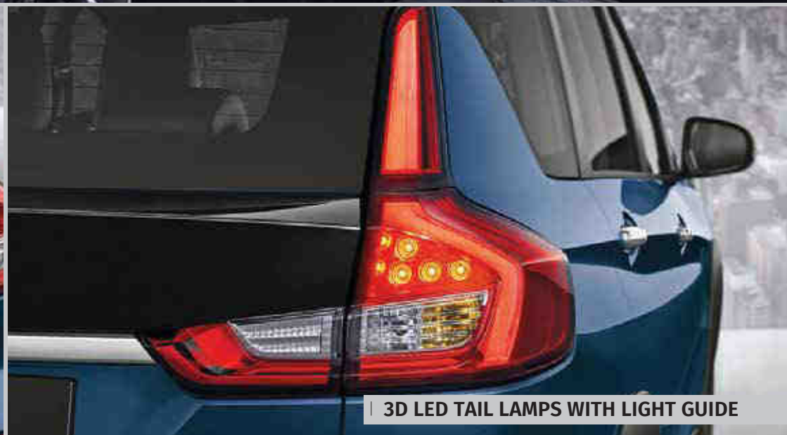
| 3D LED TAIL LAMPS WITH LIGHT GUIDE