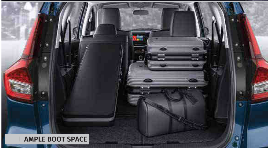
| AMPLE BOOT SPACE