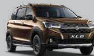
| BRAVE KHAKI