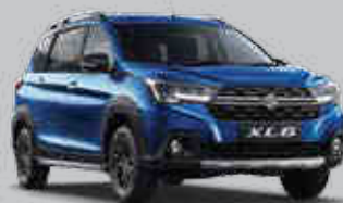
| PREMIUM STARGAZE BLUE