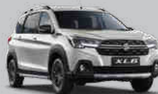
| ARCTIC WHITE