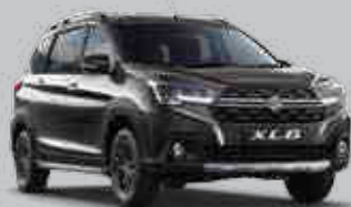
| MAGMA GREY