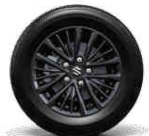
GLOSSY BLACK ALLOY WHEELS