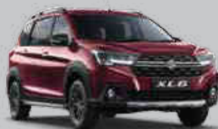
| AUBURN RED