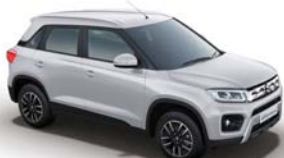
Pearl Arctic White (ZHH)