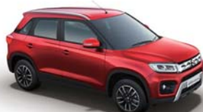
Metallic Sizzling Red (WAA)