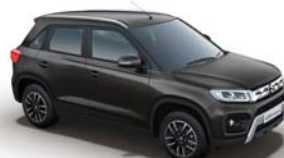
Granite Grey (ZTN)