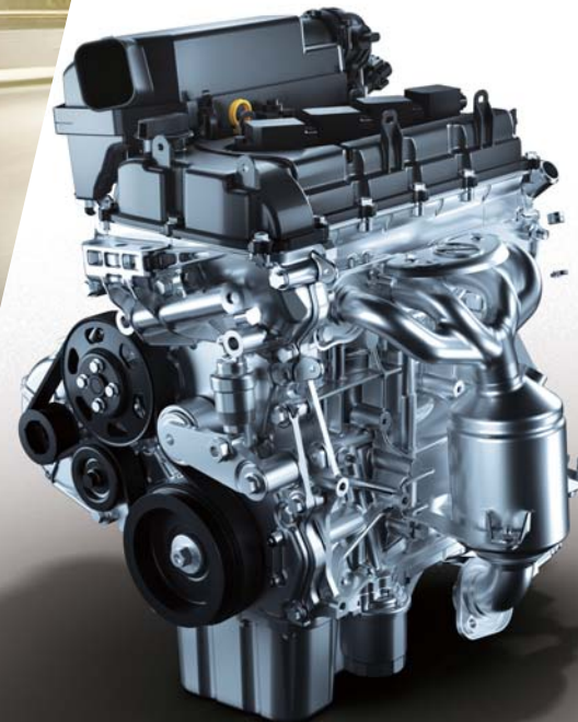
1.5 Petrol engine