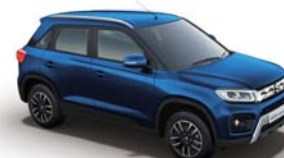
Torque Blue (ZTG)