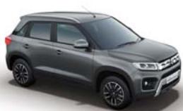
Premium Silver3 (ZQS)