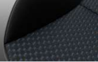
Blue interior accents (White Pearl only)