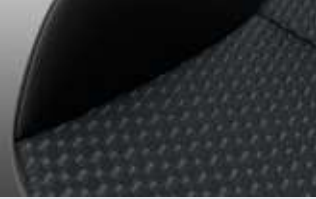
Silver interior accents.