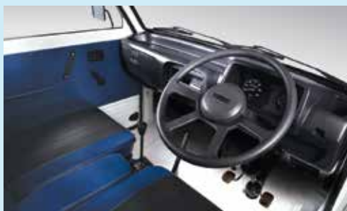
Newly designed instrument panel with New 4 spoke steering.

With upgraded features and advanced Euro-III technology, now your Suzuki Ravi is more environment friendly. Now drive the extra mile, with high standard engine performance in low fuel consumption and inexpensive maintenance that lets your savings augment in an economical way!