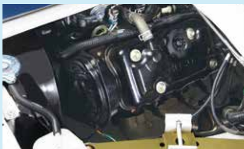
New EFI Engine.