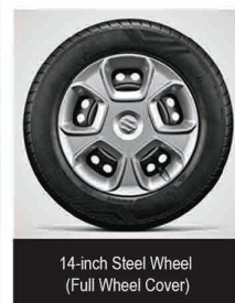
14-inch Steel Wheel (Full Wheel Cover)