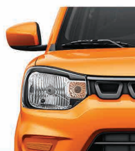
Multi-reflector Halogen Headlamps

The S-PRESSO is designed inside out for spaciousness and comfort. This ensures that it just not appears big on the outside, but also delivers ample space inside, providing comfort and convenience in every drive for both the driver and passengers. The high seating position, true to its concept, gives the driver a commanding view.