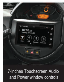
7-inches Touchscreen Audio and Power window controls