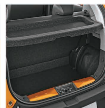
Ample Luggage Space