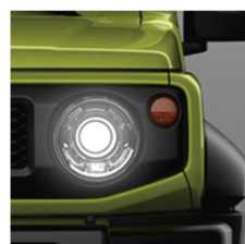
Led Headlamps with washer (GLX)