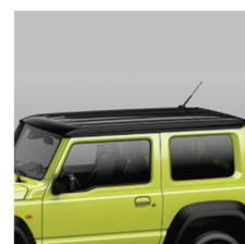
Practical drip rail