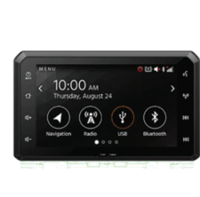
9" Infotainment System (GLX)