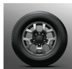
15-inch alloy wheels