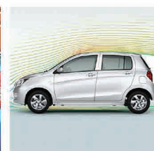
Aerodynamically Designed for Better Fuel Efficiency