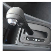
CVT Transmission for CVT Variant