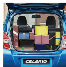
Versatile Carrying Capacity