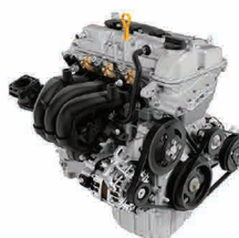
1.0 Liter, 3 Cylinder DOHC 12V Engine

A sharp front mask with expansive character lines flow into a rear profile designed for aerodynamics that work to create a stylish silhouette, belying the spacious interior.