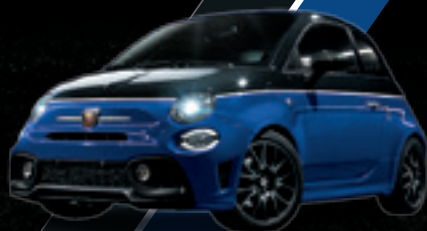
626 - Scorpione Black / Podium Blue