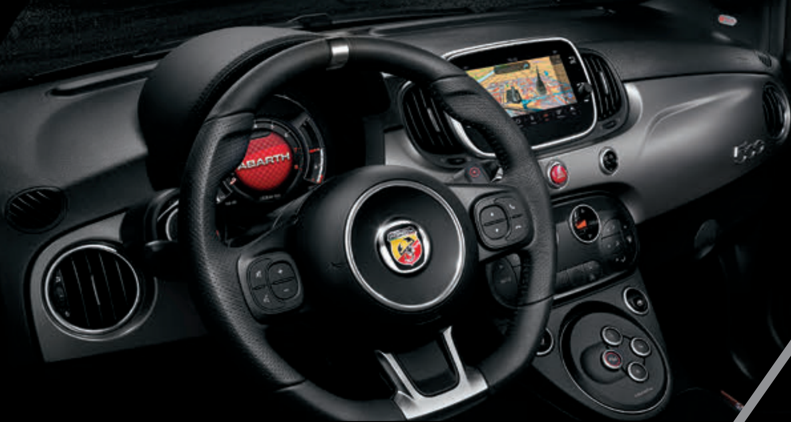
Matt grey dashboard