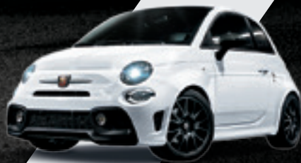
227 - Ghiaccio White