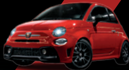
176 - Abarth Red