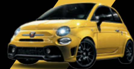
258 - Modena Yellow