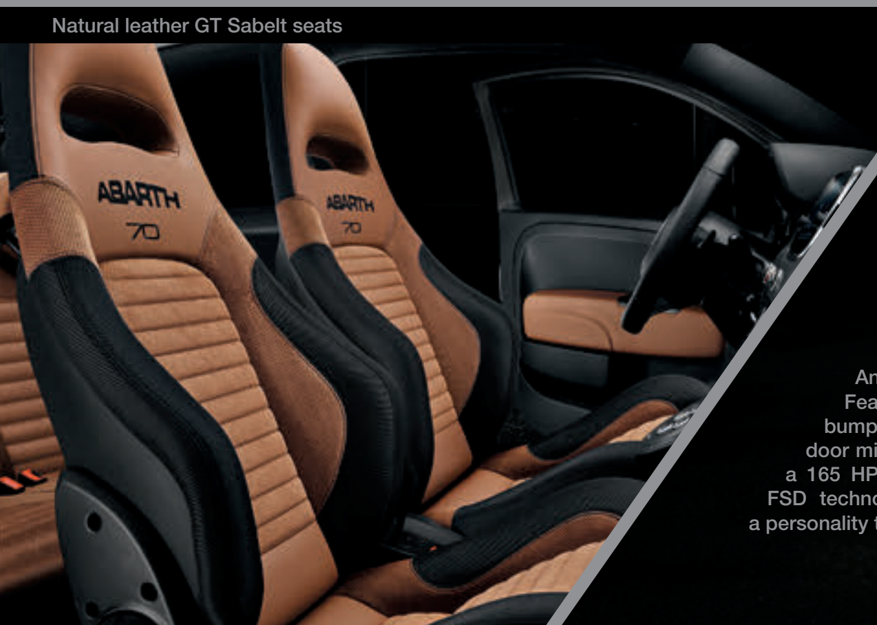
Natural leather GT Sabelt seats

An unsurpassable style that creates breathtaking emotions. Featuring leather sporty Abarth seats, body colour front and rear bumper inserts, tinted rear windows and satin chrome finished door mirror covers. The performance element can never be forgotten, a 165 HP engine with Garrett Turbo and Koni rear suspensions with FSD technology (Frequency Selective Damping). Abarth 595 Turismo, a personality that can't be ignored.