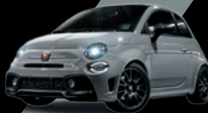
676 - Campovolo Grey