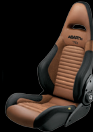
Sabelt 70 GT natural leather