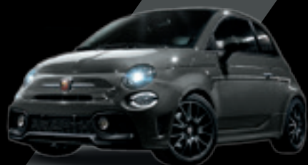
695 - Record Grey