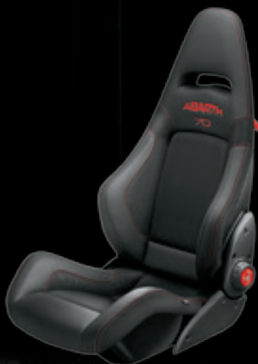
Sabelt 70 Racing Carbon with carbon shell (standard on the 595 esseesse)