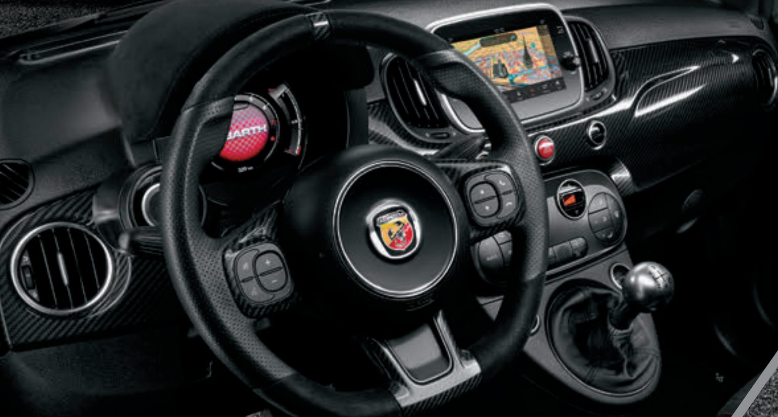
Dashboard and exterior details in Anthracite Grey finishing