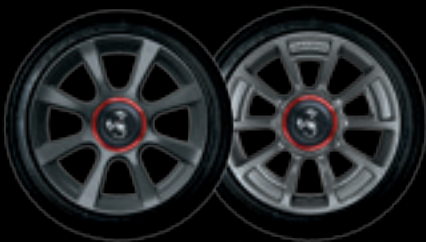
16" 8 SPOKE