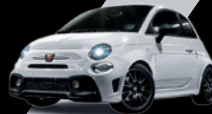
268 - Gara White