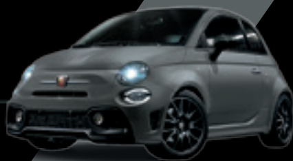
802 - Asphalt Grey