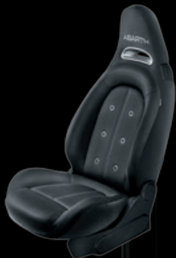
Black fabric (standard on the 595)