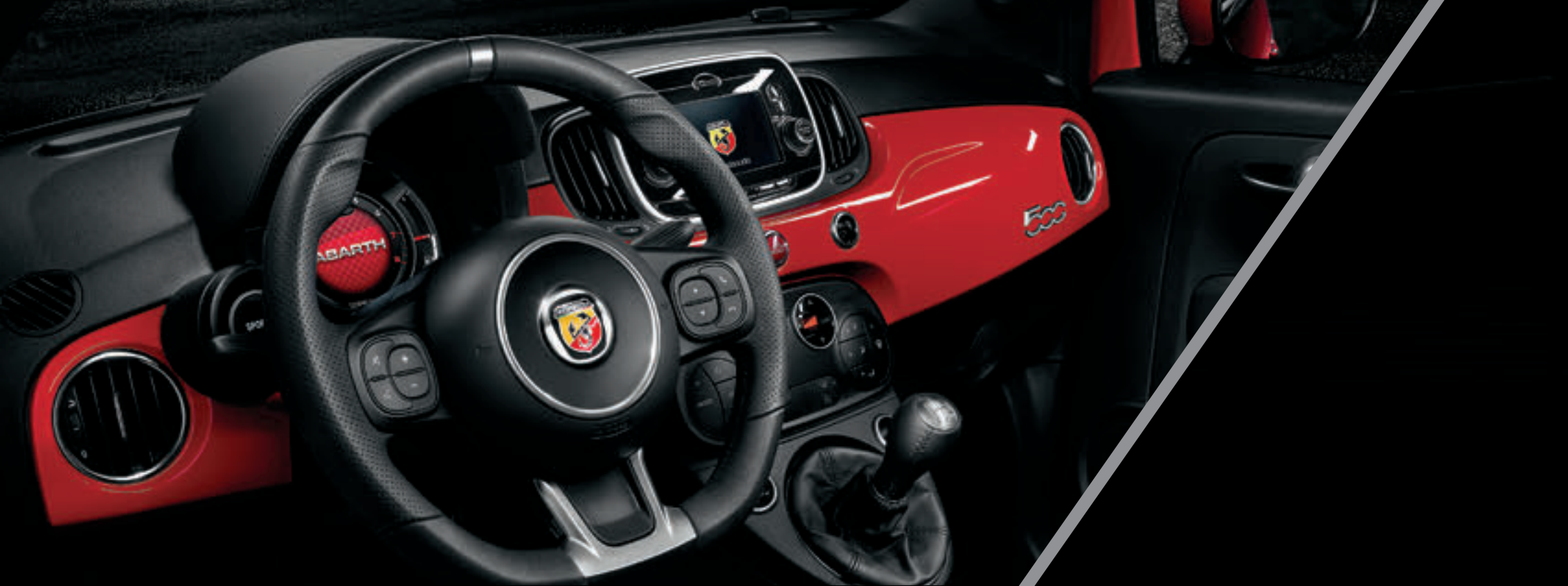
Body coloured dashboard