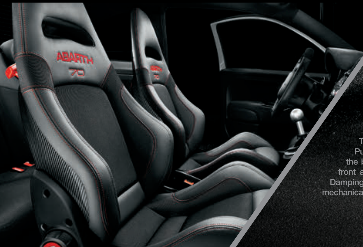
Sabelt Racing seats with carbon fiber shell

The symbol of the Scorpion's performance: Abarth 595 Esseesse. Pure power, pure performance. A car made only for those who want the best. Equipped with a 180 HP T-Jet engine with 4-cylinders, Koni front and rear suspensions with FSD technology (Frequency Selective Damping), white Supersport 17" alloy wheels, Akrapovič exhaust and mechanical limited slip differential.