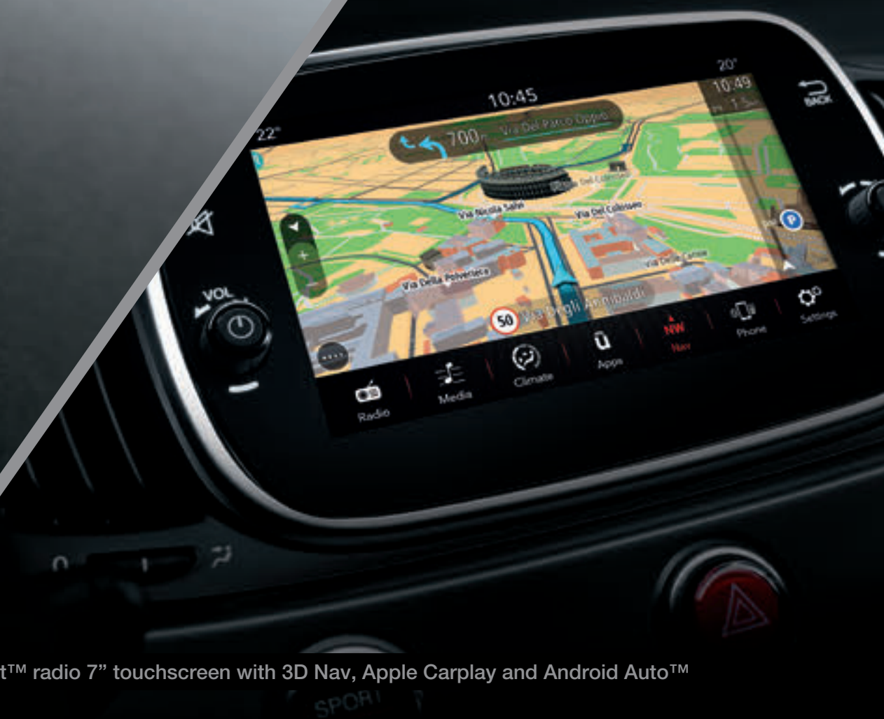
Uconnect™ radio 7" touchscreen with 3D Nav, Apple Carplay and Android Auto™