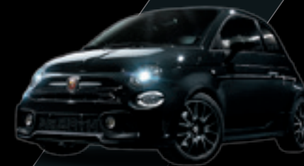
876 - Scorpione Black