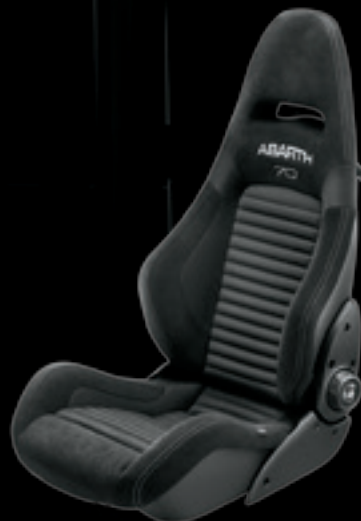
Sabelt 70 GT cloth (standard on the 595 Competizione)