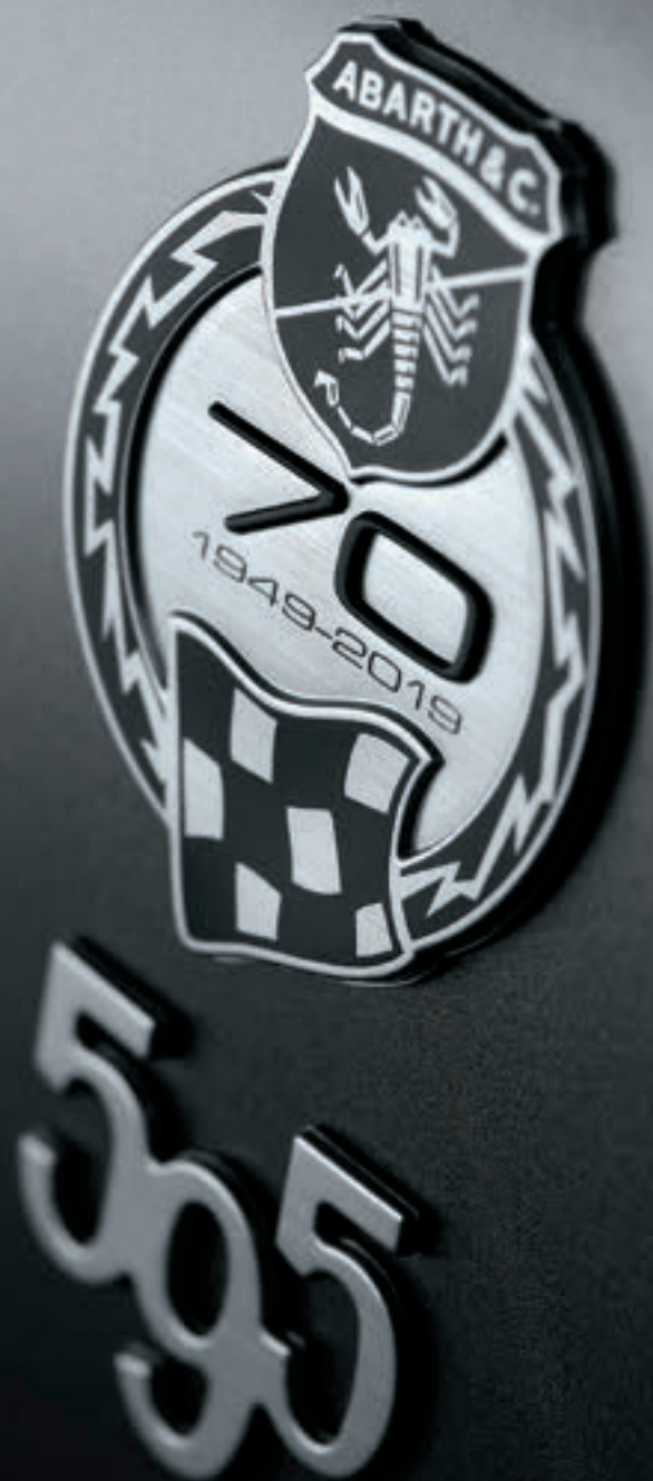
70 th Anniversary Badge