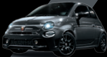
735 - Circuit Grey