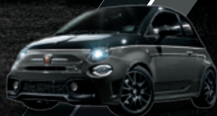
343 - Scorpione Black / Record Grey