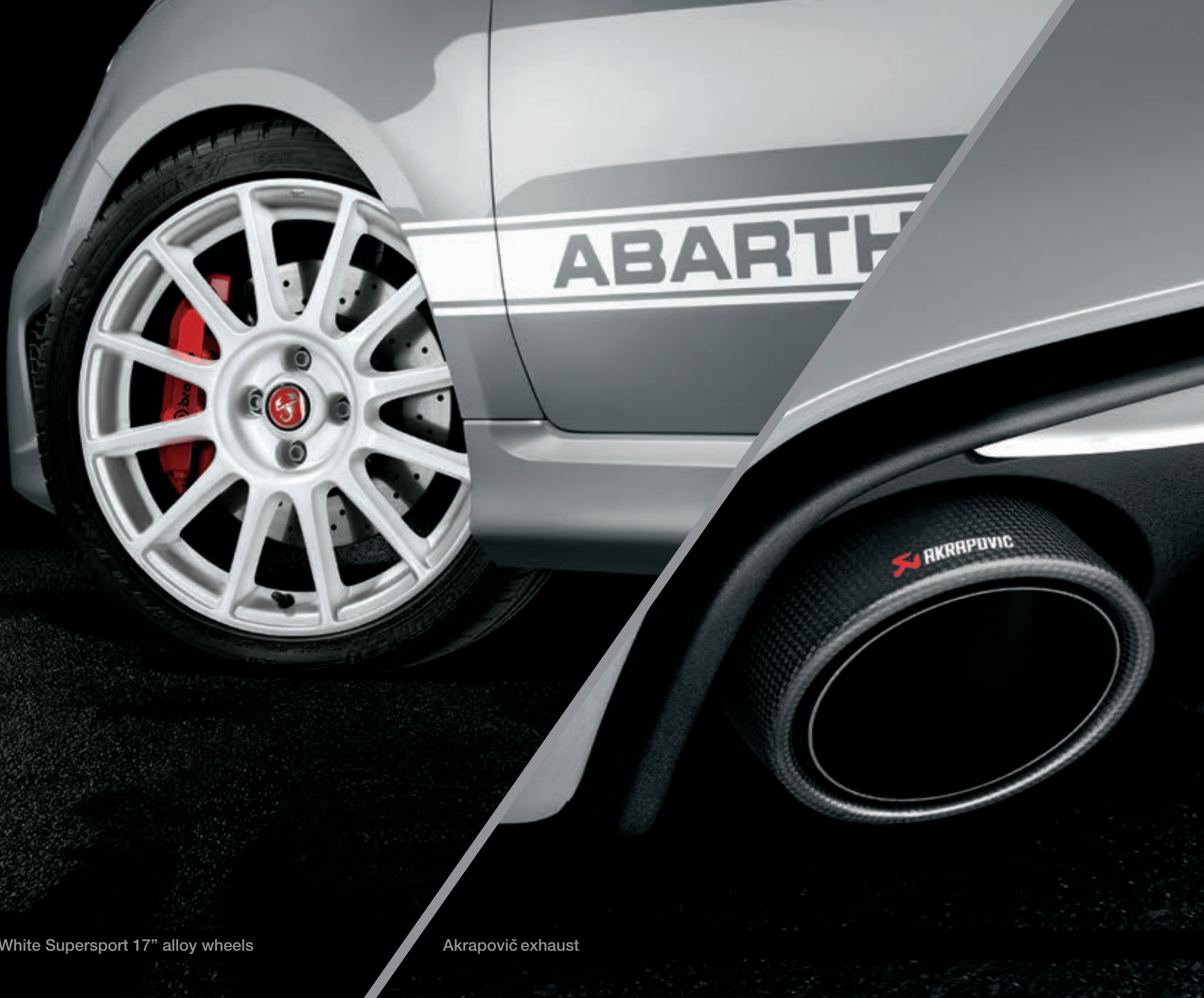
White Supersport 17" alloy wheels