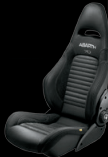
Sabelt 70 GT black leather