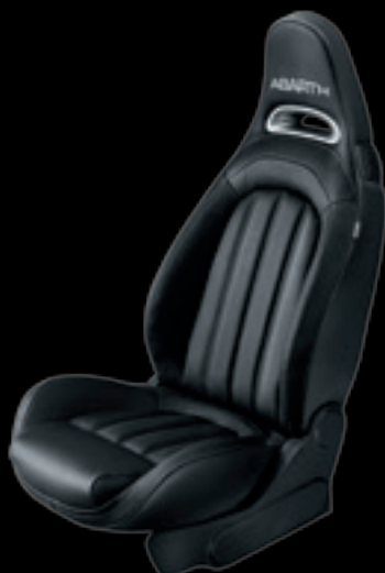
Black leather (standard on the 595 Turismo)