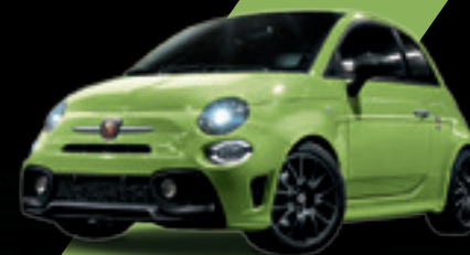
566 - Adrenaline Green