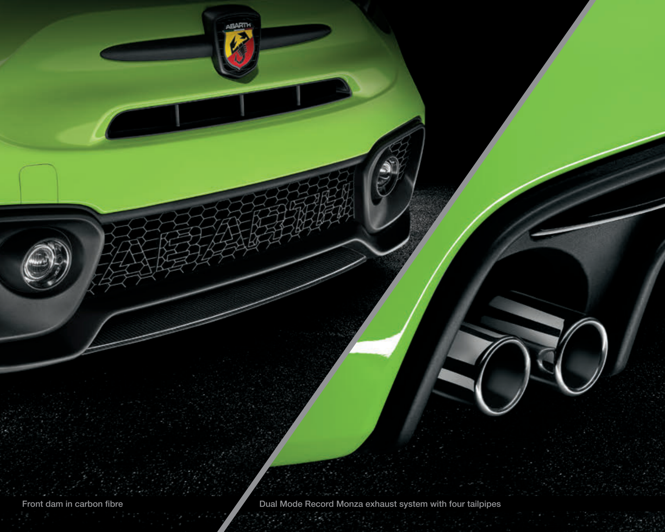
Front dam in carbon fibre