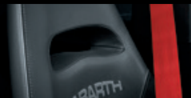
Red front&rear seatbelts