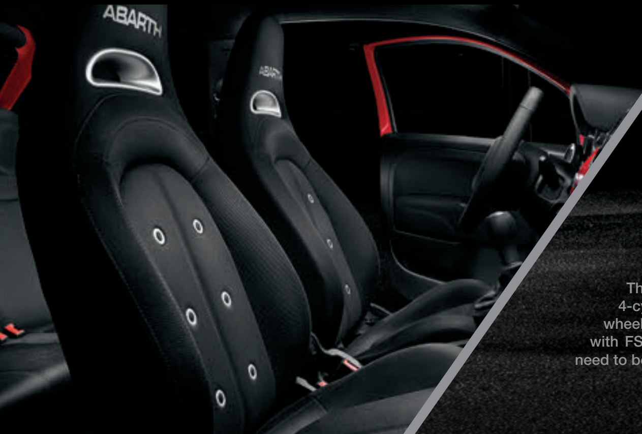
Abarth fabric sports seats with height adjustment

The perfect Abarth, for the perfect start. A 145 HP motor T-Jet 4-cylinders, dual exhaust in chromed steel, sporty leather steering wheel with viewfinder, steering wheel controls and rear suspensions with FSD technology (Frequency Selective Damping). Everything you need to be stung by the Scorpion.