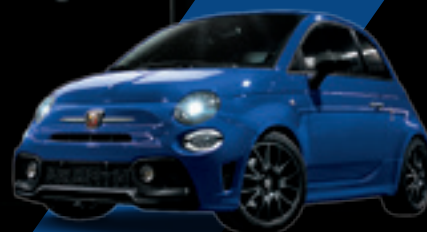
369 - Podium Blue