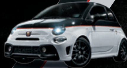
220 - Scorpione Black / Gara White