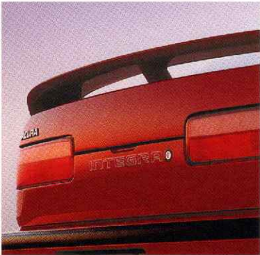
The aerodynamic spoiler of the Integra GS 3-door provides both reduced lift and sporty styling. Inside, power windows add a touch of luxury to the GS model.