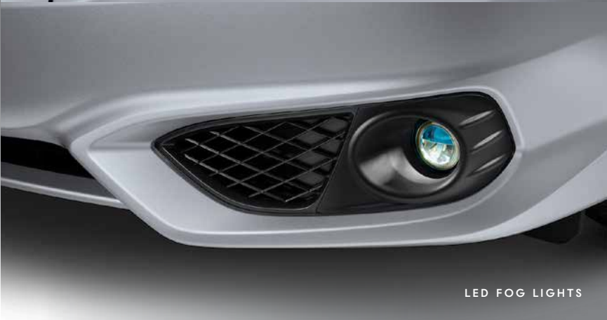
LED FOG LIGHTS