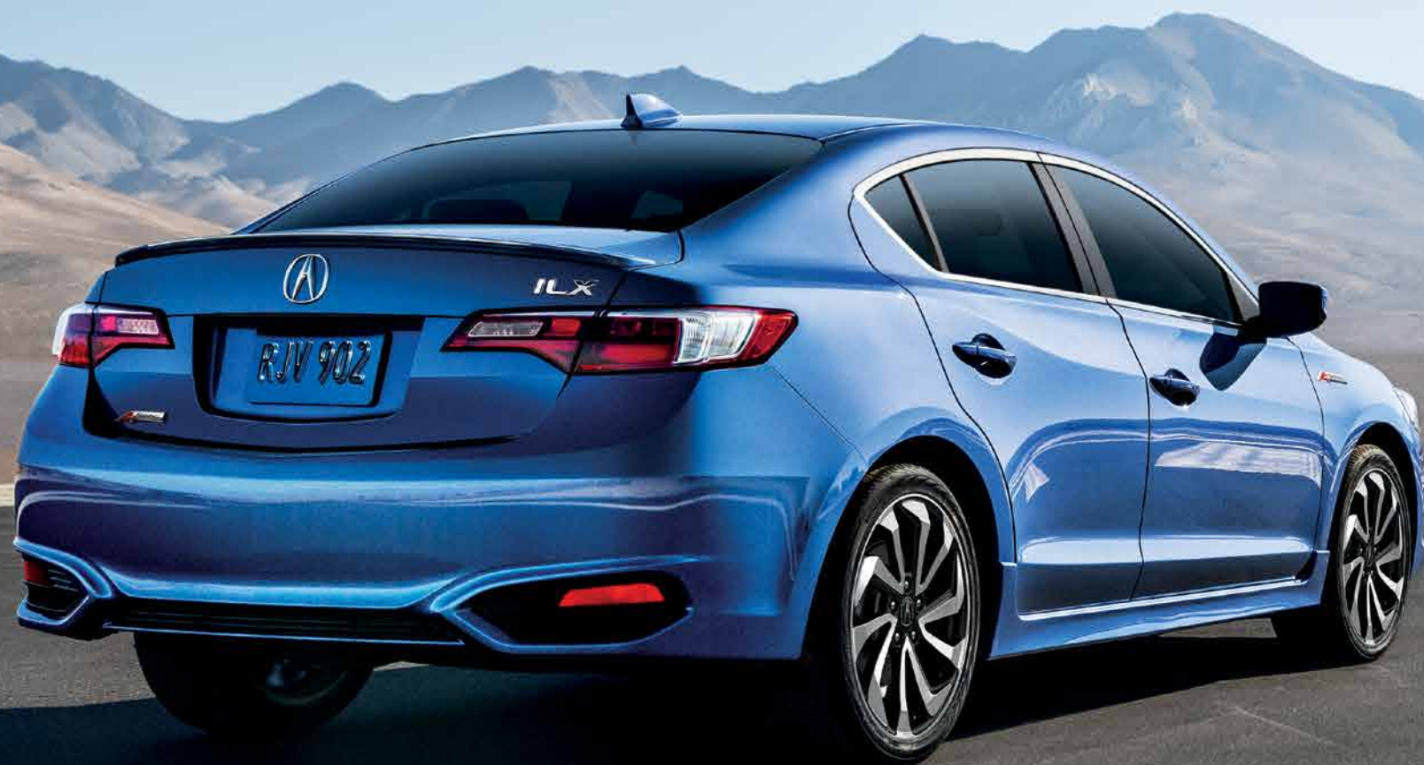
ILX with A-SPEC Package shown in Catalina Blue Pearl.

Always use seat belts and appropriate child seats. Children 12 and under are safest when properly restrained in a rear seat. Properly secure all items stored in the cargo area. Always read the vehicle owner's manual for detailed vehicle operation and feature information.