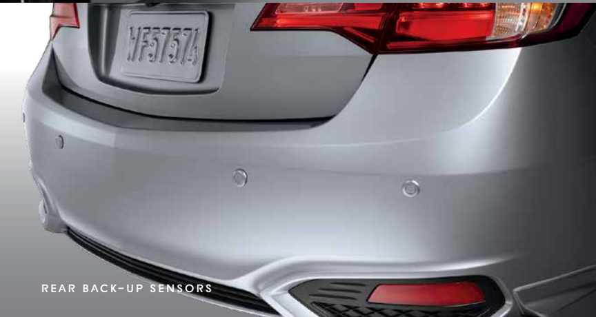
REAR BACK-UP SENSORS