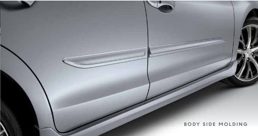
BODY SIDE MOLDING