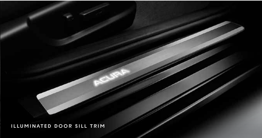
ILLUMINATED DOOR SILL TRIM