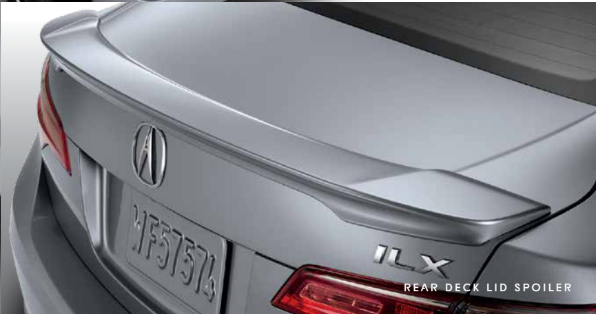
REAR DECK LID SPOILER