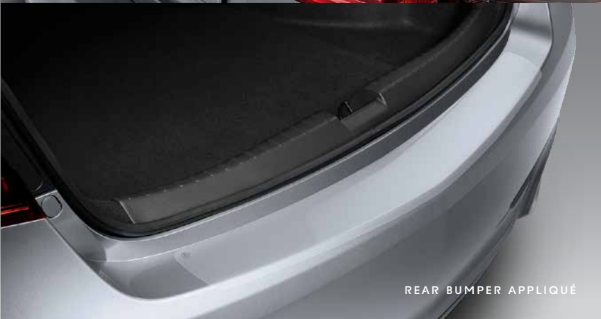
REAR BUMPER APPLIQUE