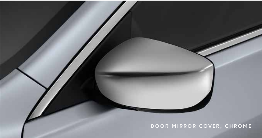
DOOR MIRROR COVER, CHROME