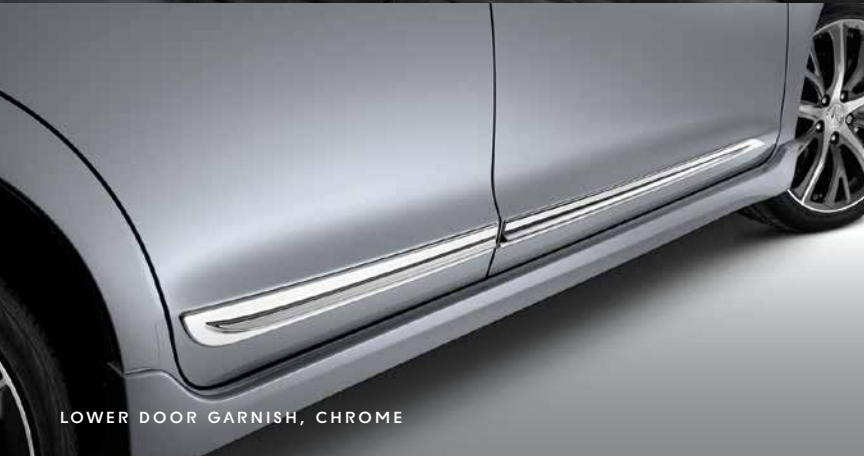
LOWER DOOR GARNISH, CHROME