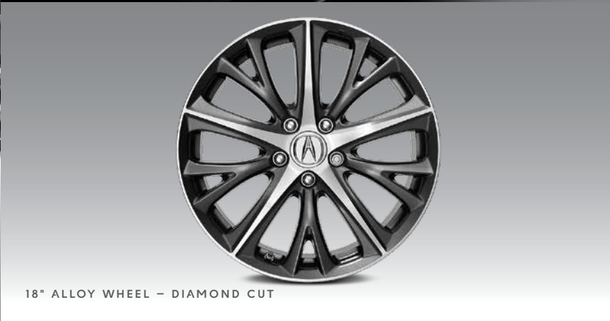
18" ALLOY WHEEL – DIAMOND CUT