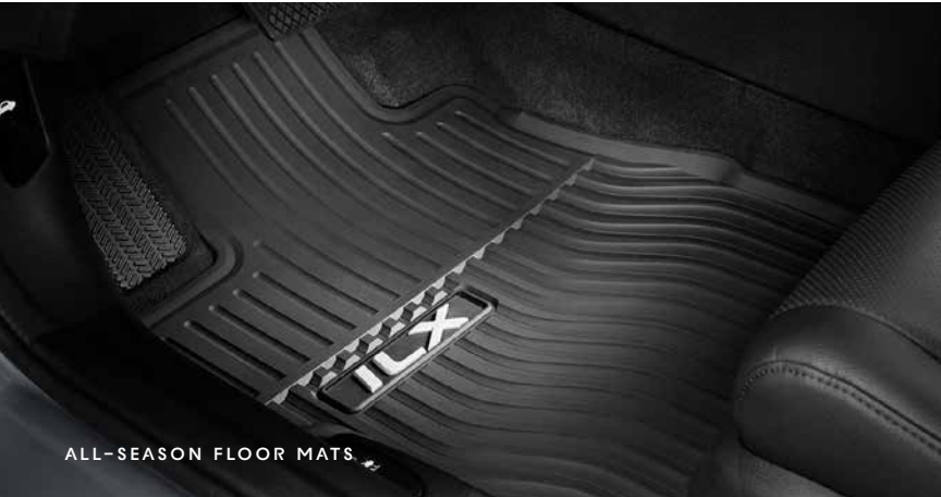
ALL-SEASON FLOOR MATS

Accessories listed in the packages may also be added individually to your ILX. Accessories and packages are subject to inventory availability.