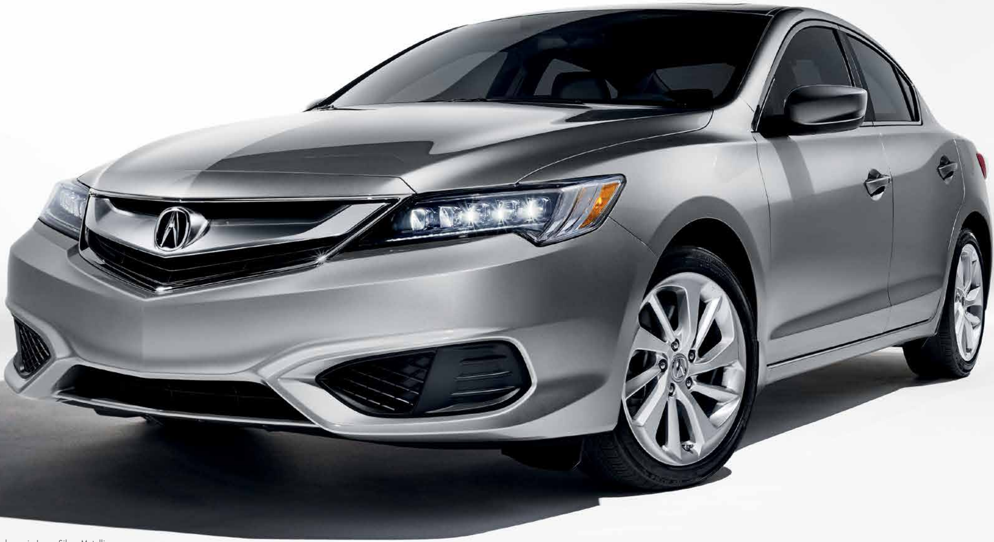
ILX with Premium Package shown in Lunar Silver Metallic.

Whether you're on the racetrack or on a road trip, how far ahead you can see affects everything. Jewel Eye™ LED headlights are standard on every Acura and help to provide impressive down-the-road visibility with an intense, wide beam of light designed to mimic natural sunlight—the light our eyes are designed to see in. The intended result? Less fatigued driving, more clarity and vivid colours.