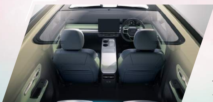
Panoramic electric sunroof and sunshade style sunroof