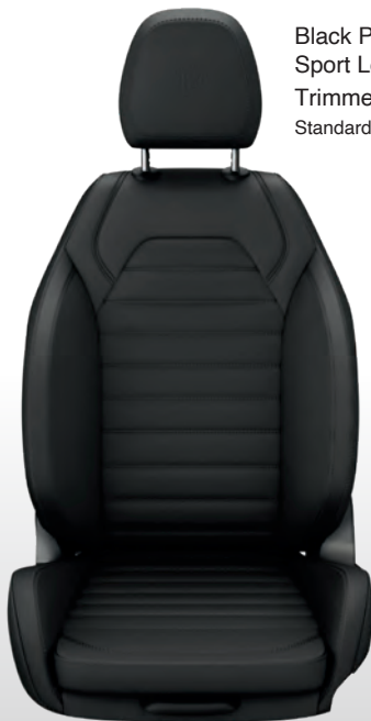
Black Performance Sport Leather- Trimmed Seat Standard

21-inch Dark 5-hole aluminum wheels Red Performance Sport leather-trimmed seats Veloce-exclusive metallic paint: Rosso Etna