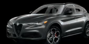
Vesuvio Grey Metallic