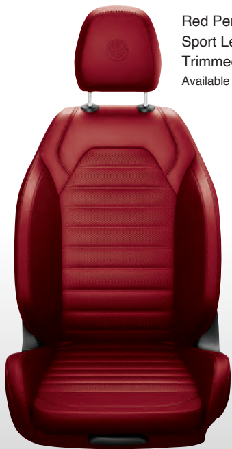
Red Performance Sport Leather- Trimmed Seat Available