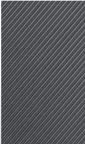
Aluminum Interior Trim Standard