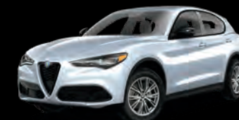
Moonlight Grey Metallic