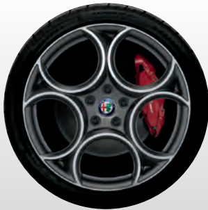
19-inch Sport 5-Hole Aluminum Wheel Available