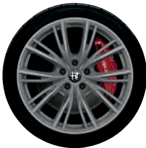
18-inch Multi-Spoke Aluminum Wheel Standard