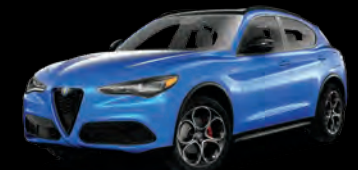
Misano Blue Metallic