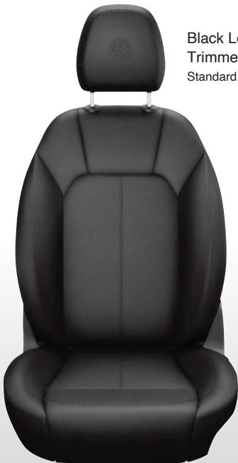
Black Leather-Trimmed Seat Standard