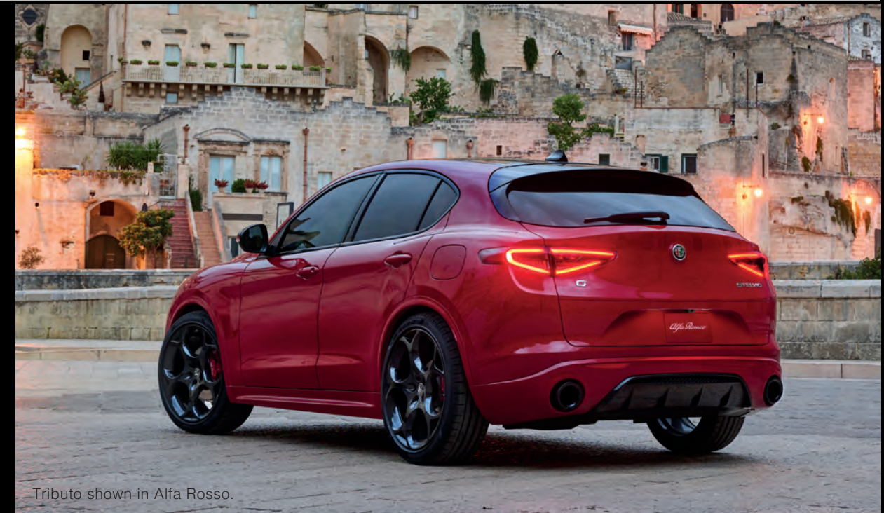
Tributo shown in Alfa Rosso.

New “carbon design” dashboard fascia with the Alfa Romeo logo, ambient lighting and aluminum kickplate