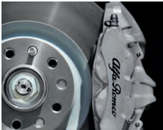
Silver-Painted Brake Calipers with Black Script Standard