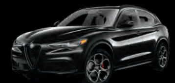
Vulcano Black Metallic

Some colours may be limited/restricted based on availability.