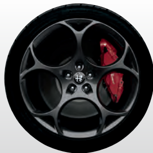
21-inch Dark 5-Hole Aluminum Wheel Available