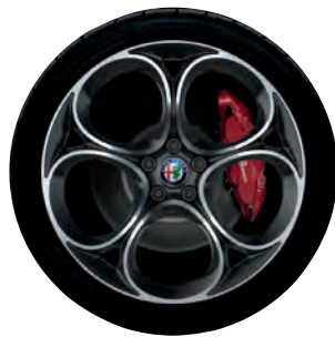
20-inch Sport 5-Hole Aluminum Wheel Standard