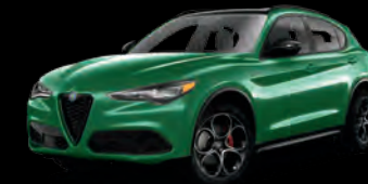
Verde Fangio Metallic