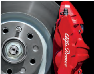
Red-Painted Brake Calipers with White Script Available