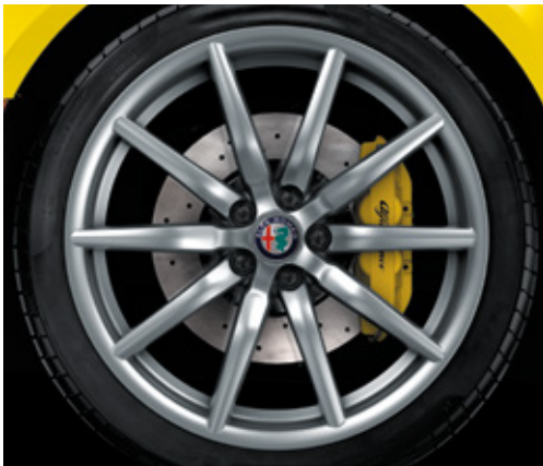
18-/19-inch Bright fan-spoke aluminum Available