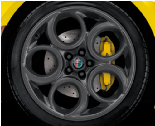
18-/19-inch Dark 5-hole aluminum Available