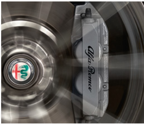
Silver brake calipers Standard