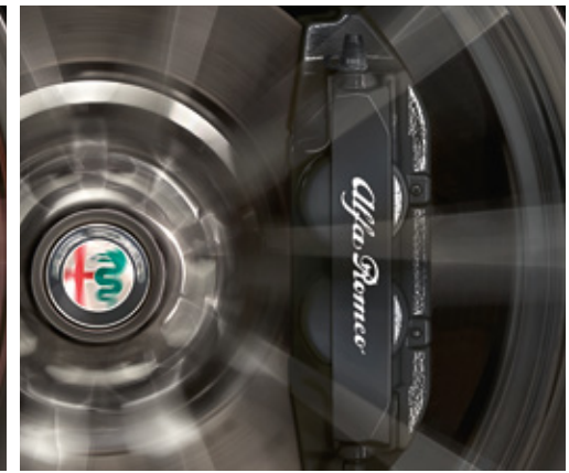
Black brake calipers Available