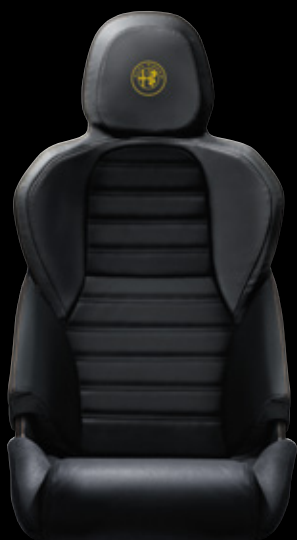
Black leather trim with Yellow accent stitching Available