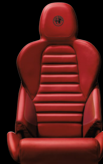
Red leather trim with Black accent stitching Available