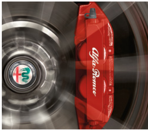
Red brake calipers Available