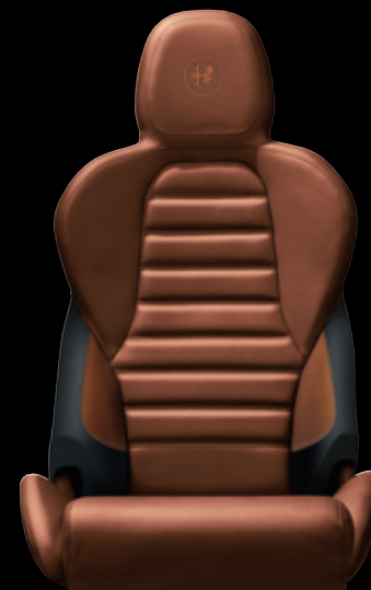
Black/Tobacco leather trim with Dark Brown accent stitching Available