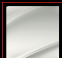
Composite body shell