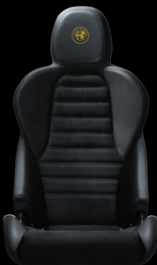
Black leather trim and microfibre with Yellow accent stitching Available