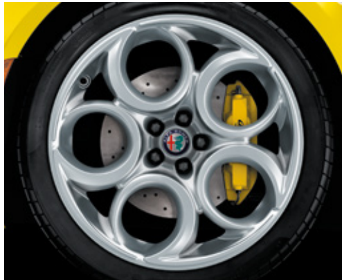
18-/19-inch Bright 5-hole aluminum Available