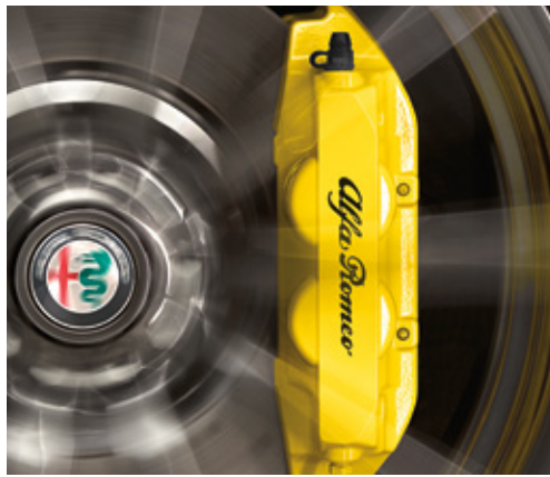
Yellow brake calipers Available