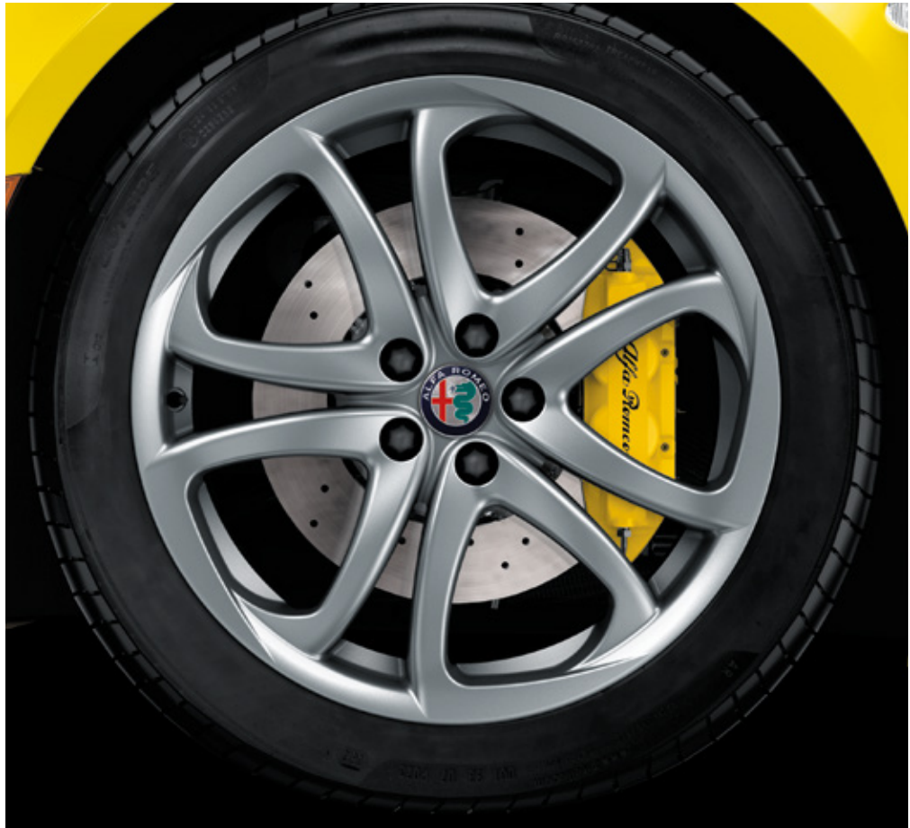
17-/18-inch Bright aluminum Standard