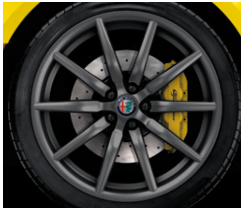
18-/19-inch Dark fan-spoke aluminum Available