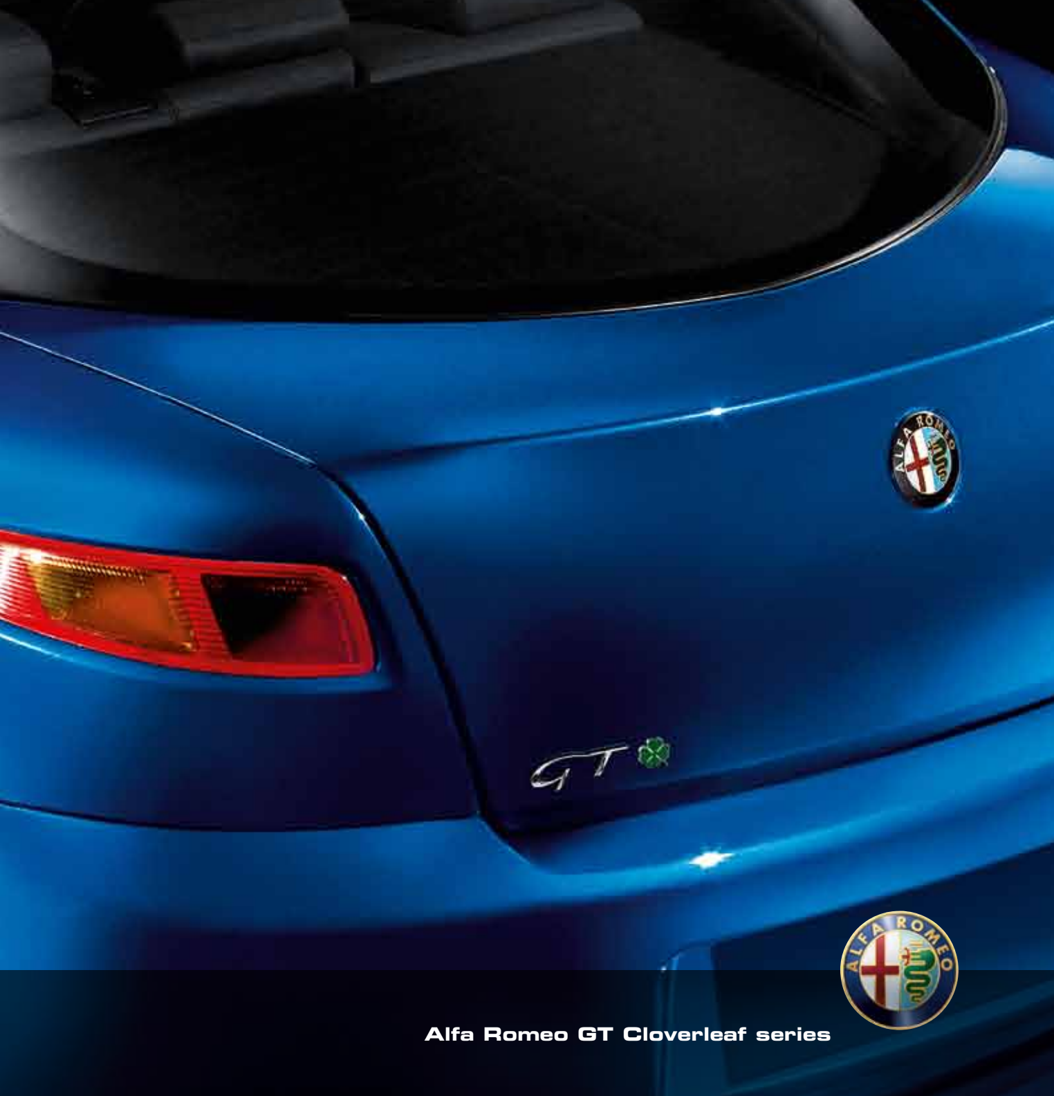
Alfa Romeo GT Cloverleaf series