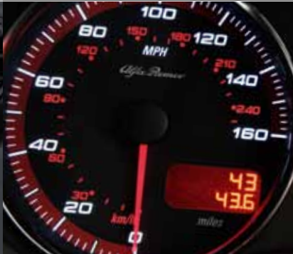
Sports dials with red background