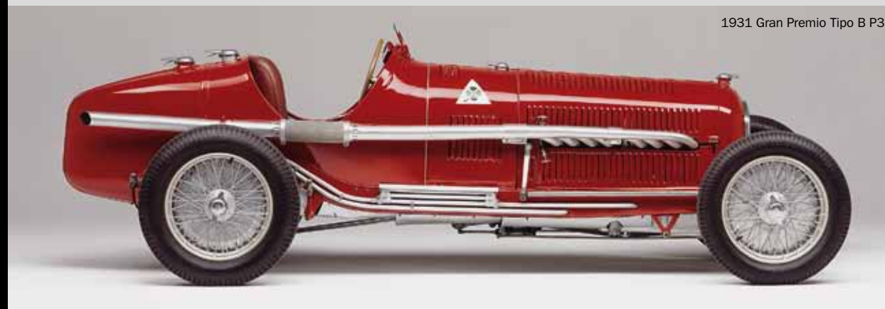
1931 Gran Premio Tipo B P3