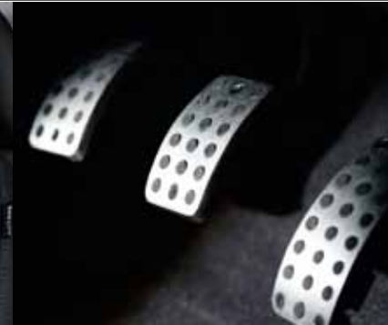
Aluminium sports pedals