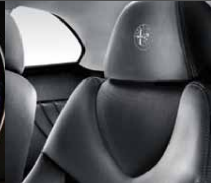
Sports seats upholstered in black sports leather