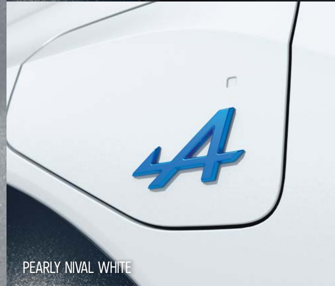
PEARLY NIVAL WHITE