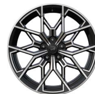
04_ WHEELS 19" SNOWFLAKE ALU DIAMOND.