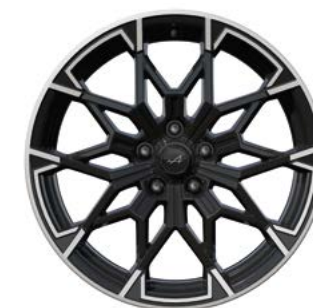
03_ WHEELS 19" SNOWFLAKE BLACK DIAMOND.