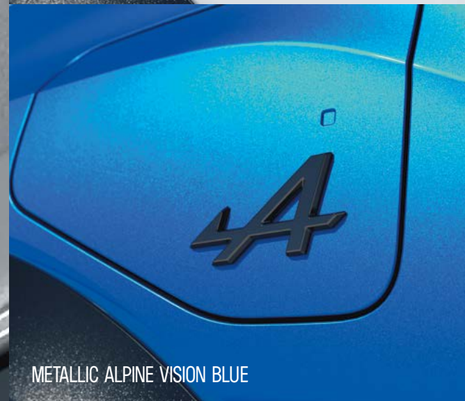
METALLIC ALPINE VISION BLUE