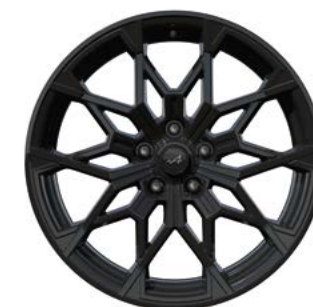
02_ WHEELS 19" BLACK SNOWFLAKE.