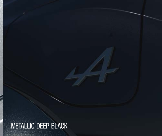
METALLIC DEEP BLACK