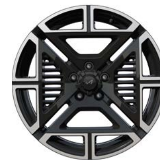
01_ WHEELS 19" ICONIC BLACK ALU DIAMOND.