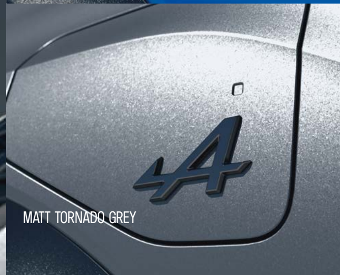
MATT TORNADO GREY