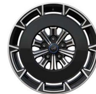
05_ WHEELS 19" SNOWFLAKE FLASK.