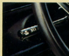
Above: Eagle 4-Door Sedan. Also shown: Optional Durham Plaid fabric seating, cruise control, power window and power door locks. Opposite: Eagle 4-Dr. Sedan.