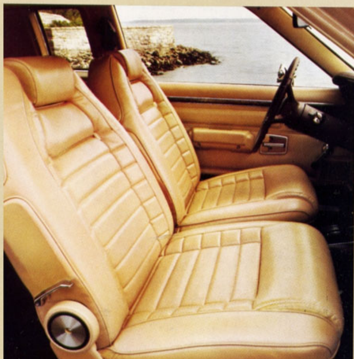
Above: Eagle 2-Door Sedan. Also shown: Standard woodgrain instrument panel (several options shown), Sport vinyl interior; optional fog lamps and AM/FM/CB stereo radio. Opposite: Eagle 2-Door Sedan with Sport Package.