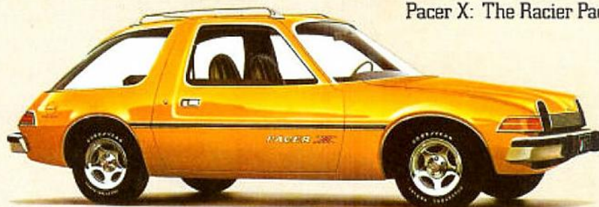
Pacer X: The Racier Pacer

Read all about all the Pacer extras in the Pacer Options Guide.