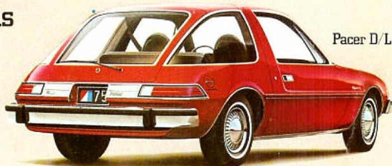
Pacer D/L: The Plusher Pacer