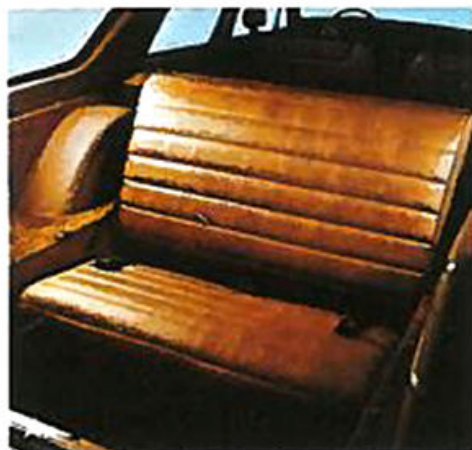
• A. Third seat option for wagons. You get a big comfortable seat, and seat belts, for two more. Plus a power tailgate window.