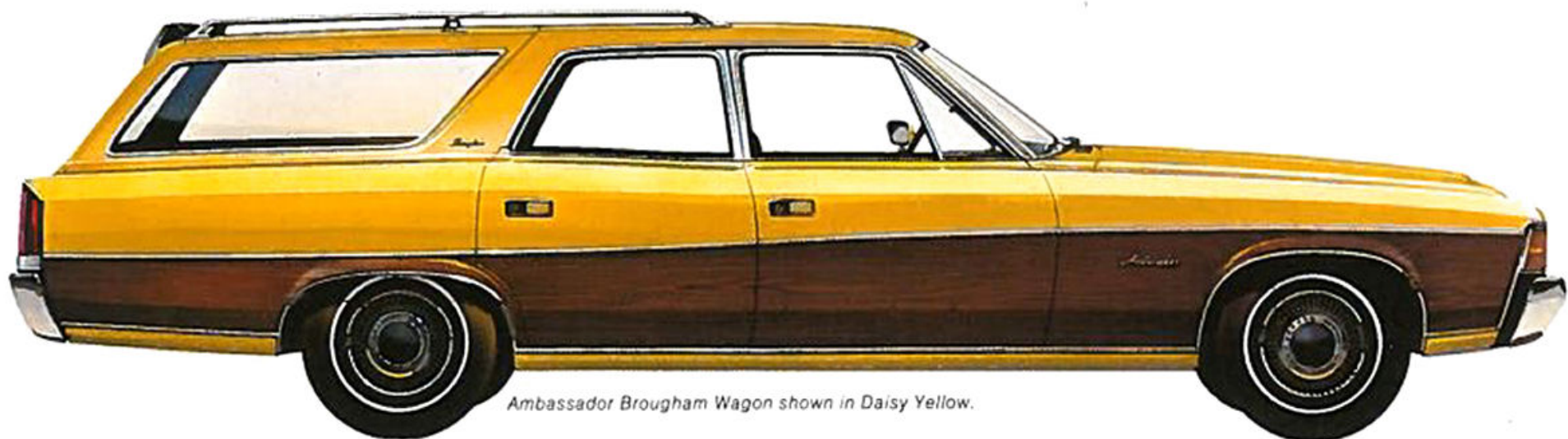
Ambassador Brougham Wagon shown in Daisy Yellow.