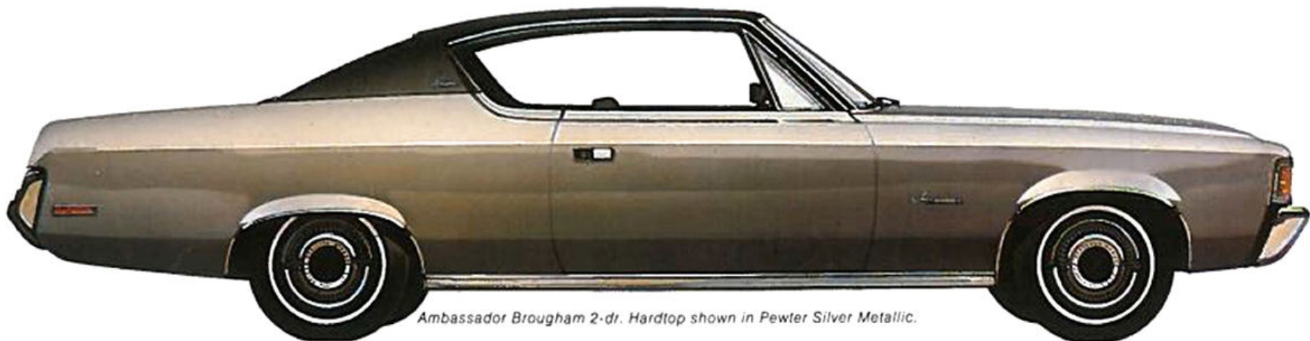
Ambassador Brougham 2-dr. Hardtop shown in Pewter Silver Metallic.