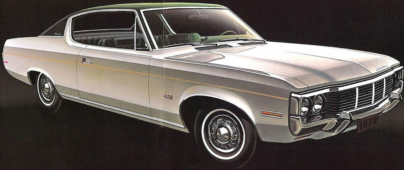
Matador 2-door hardtop in Snow White with green vinyl top.

Matador was designed to give you an extra measure of the good things you want in a luxurious family size car. Full six-passenger room and comfort. Extra touches for interior graciousness: full carpeting, foam padded front and rear seats, cigarette lighter and ash trays front and rear, a locking glove box—and many more of the niceties of motoring. The ride is superb on the longest wheelbase of any American-built intermediate size car and cushioned by 4 wheel coil-spring suspension. There are three Matador models to choose from: 4-door Sedan, 2-door Hardtop and 4-door Wagon (with optional third seat). All the desirable comfort and convenience options are available—power steering, power brakes and air conditioning just to name a few. The stylish design is emphasized by the sweeping hood and new horizontal grille with its three color-keyed bars. Matador is powered by a choice of six engines (two Sixes, four V-8's) from the standard 232 CID Six to a big 401 CID V-8. Transmissions are a standard column mounted manual or the optional "Torque-Command" automatic. If you are looking for room, style and comfort in a luxury package—look at Matador. It gives you more.