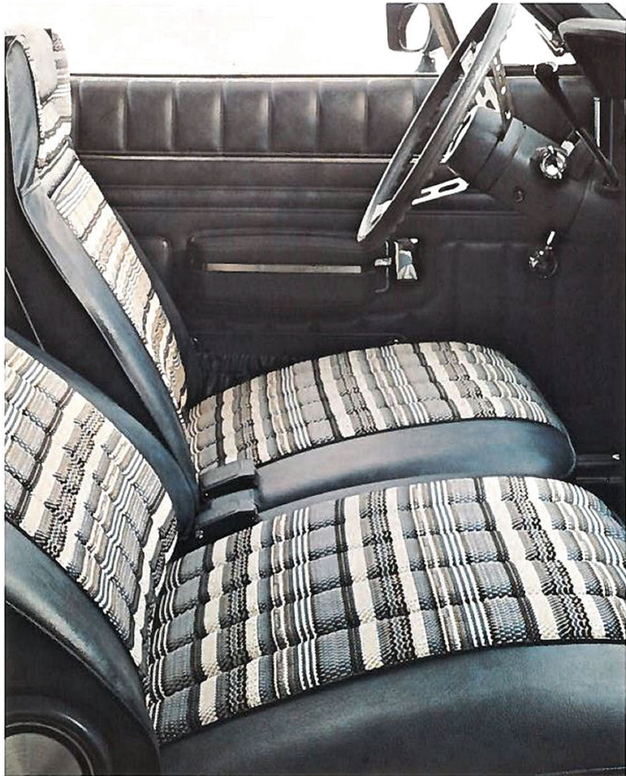
Left: Individual reclining seats (optional) available in two optional trim styles: rich, perforated vinyl and (shown in blue) custom fabric with grained-vinyl bolster.