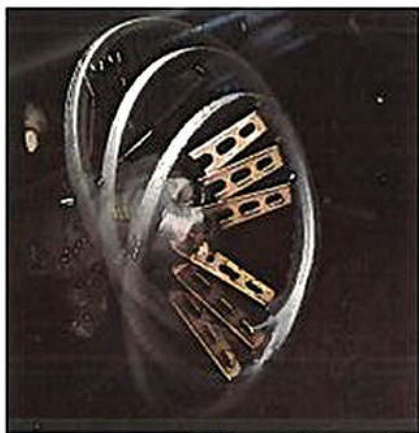
Left: Instrument panel with optional Adjust-O-Tilt steering column and 15" sports steering wheel.