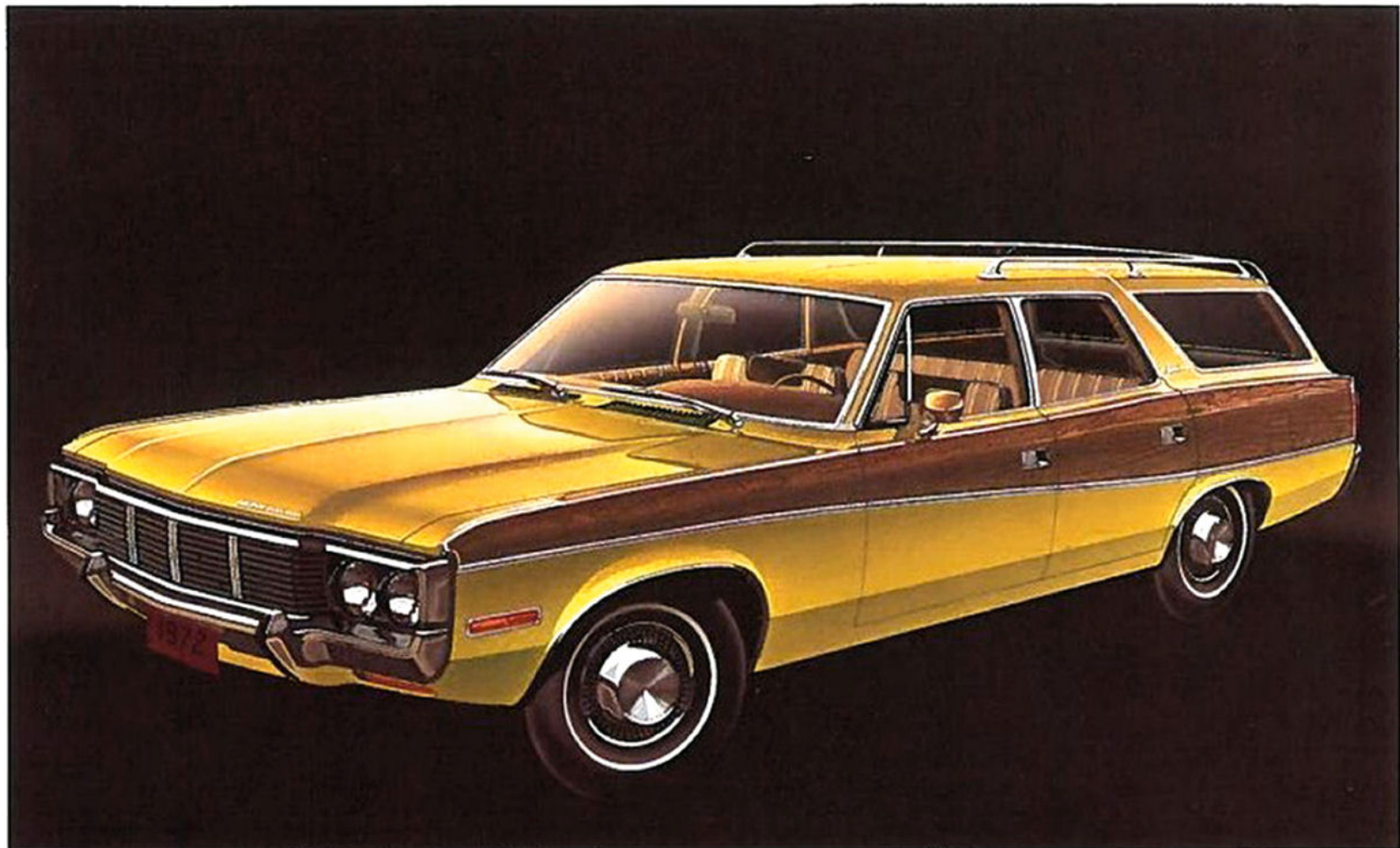
4-door wagon in Canary Yellow with optional woodgrain panels.