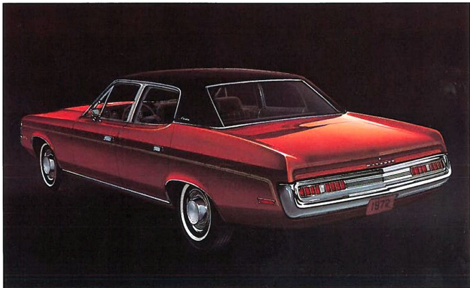
Matador 4-door Sedan in Sparkling Burgundy with standard double body side stripes.