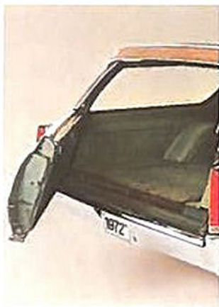
Center left: Dual-Swing tailgate, standard on Matador Wagon models.