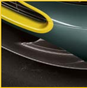
Carbon-Fibre front splitter