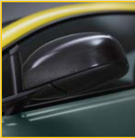
Carbon-Fibre mirror caps