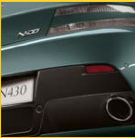
Carbon-Fibre rear diffuser