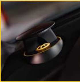
1000 W Bang & Olufsen BeoSound audio system with ICEpower® technology featuring black anodised speaker grilles with accent feature