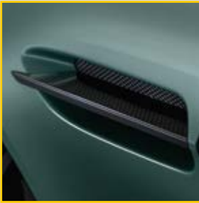
Carbon-Fibre side strakes