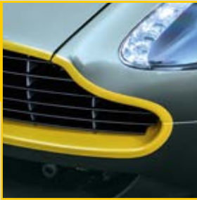
ClubSport Graphics Pack*