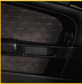
Carbon-Fibre door grabs