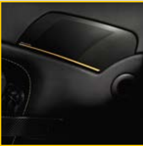
1000 W Bang & Olufsen BeoSound audio system with ICEpower® technology featuring black anodised speaker grilles with accent feature