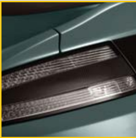
Carbon-Fibre rear lamp infills