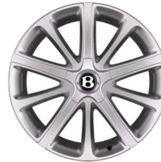
21" 10-SPOKE ALLOY WHEEL – POLISHED