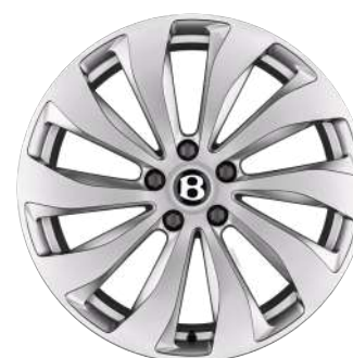
22" MULLINER DRIVING SPECIFICATION 10-SPOKE ALLOY WHEEL – POLISHED

Please refer to specifications and options on pages 45 to 46 for standard and optional wheels.