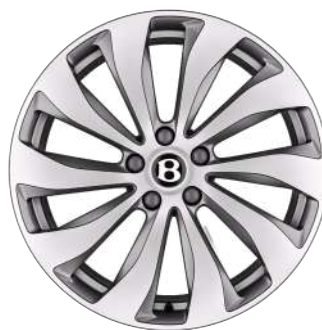
22" MULLINER DRIVING SPECIFICATION 10-SPOKE ALLOY WHEEL – DARK GREY PAINTED AND BRIGHT MACHINED