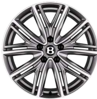
21" 10 TWIN-SPOKE ALLOY WHEEL – DARK GREY PAINTED AND BRIGHT MACHINED