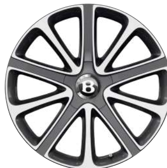
21" 10-SPOKE ALLOY WHEEL – GREY PAINTED AND BRIGHT MACHINED