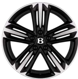
21" 5 TRI-SPOKE ALLOY WHEEL – BLACK PAINTED AND BRIGHT MACHINED