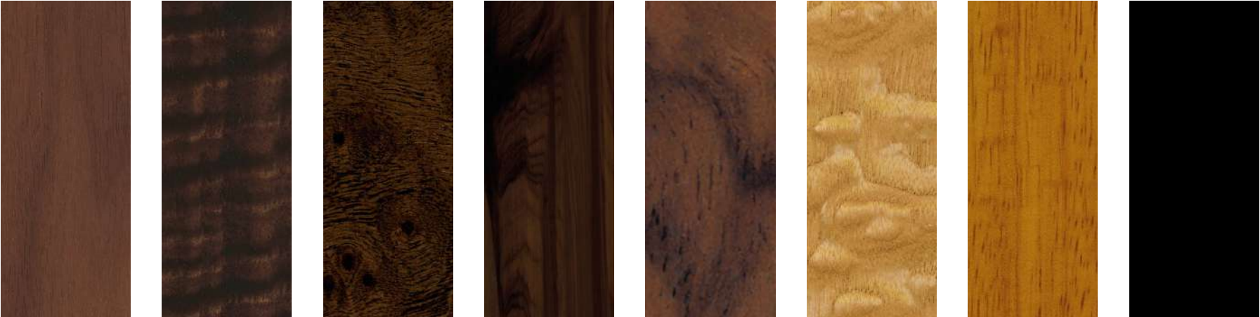
Crown Cut Walnut Dark Fiddleback Eucalyptus Dark Stained Burr Walnut Liquid Amber Burr Walnut Tamo Ash Koa Piano Black