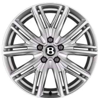
21" 10 TWIN-SPOKE ALLOY WHEEL – PAINTED